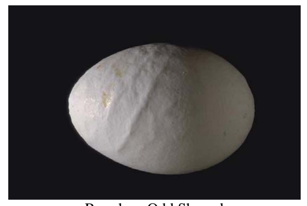
Rough or Odd Shaped