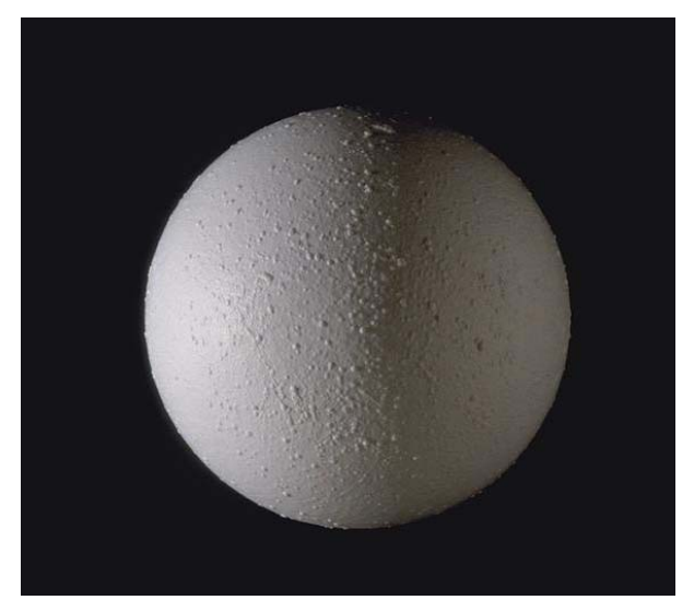
Sand paper texture