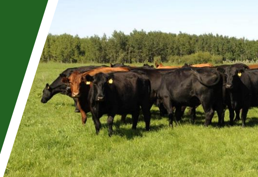
Number of Total Cattle, Feeders and Calves Sold a Through Manitoba Auction Markets, 2020 - 2022 (monthly and year-to-date total)