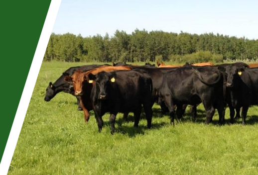
Number of Total Cattle, Feeders and Calves Sold a Through Manitoba Auction Markets, 2020 - 2022 (monthly and year-to-date total)