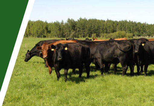
Number of Total Cattle, Feeders and Calves Sold a Through Manitoba Auction Markets, 2020 - 2022 (monthly and year-to-date total)