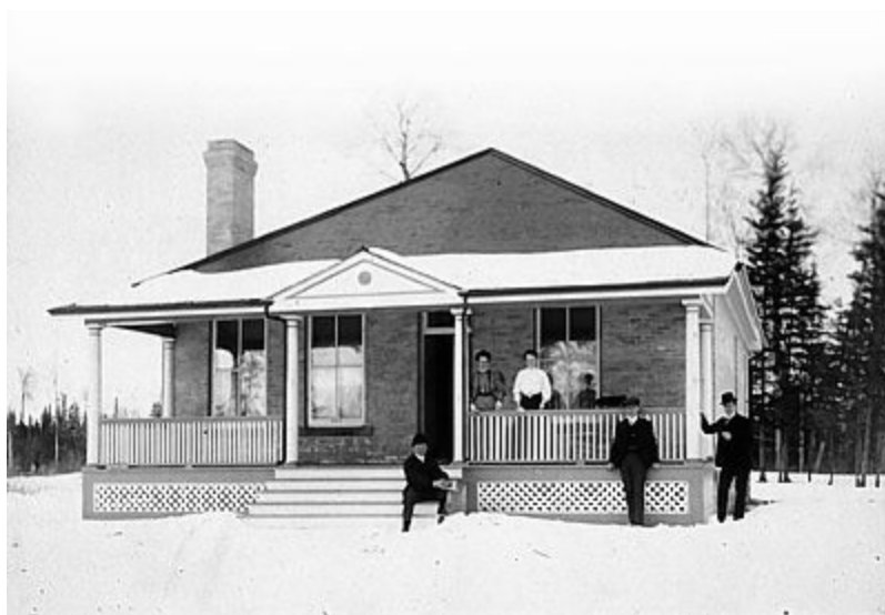
One of the brick houses, January 10, 1908.