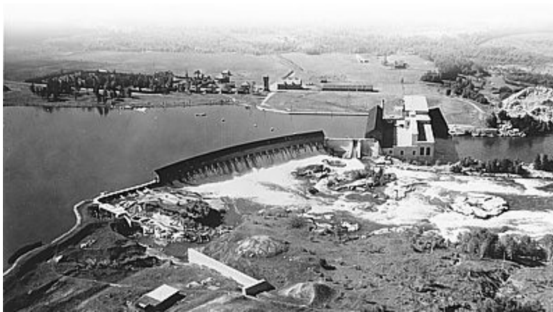
The Pinawa hydroelectric plant and town, c. 1920s.