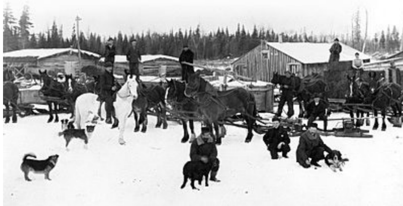
Company teams did much of the work and provided transportation, c. 1908.