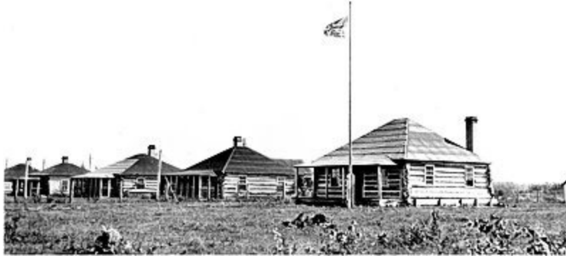
Pinawa Channel School (on right) and log cottages of W. E. St. Rly. Co. at Pinawa, 1914.