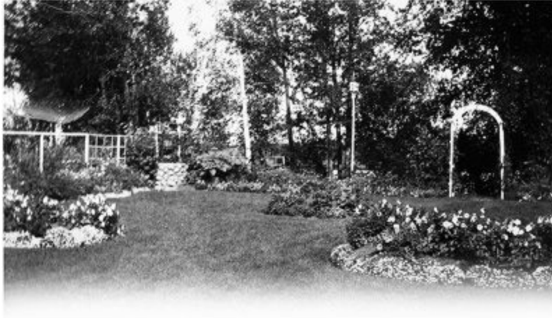
The Gibbons garden was one of many beautiful yards, c. 1940s.