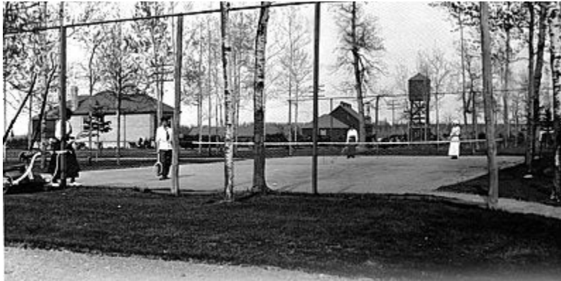
Tennis courts, c. 1914.

rink. The curling rink had one sheet of ice. Teams from Great Falls, Pointe du Bois, Seven Sisters and even the Granite Curling Club in Winnipeg, came to play.