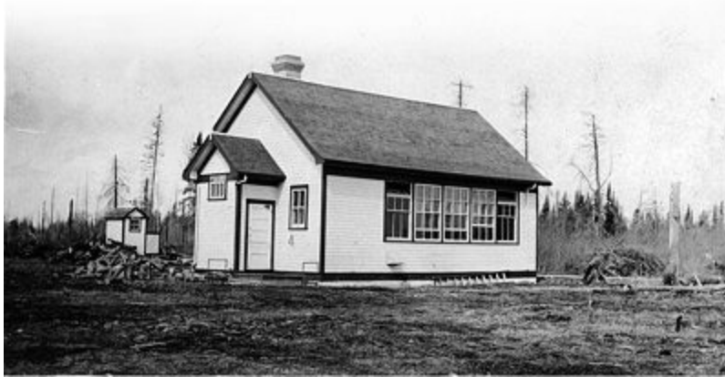
The second Pinawa school, 1940s.