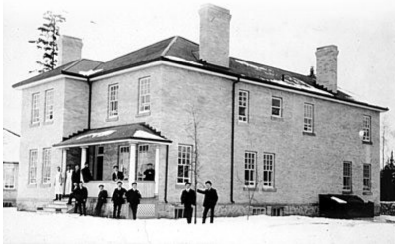
Old Pinawa's staff house, c. 1908.