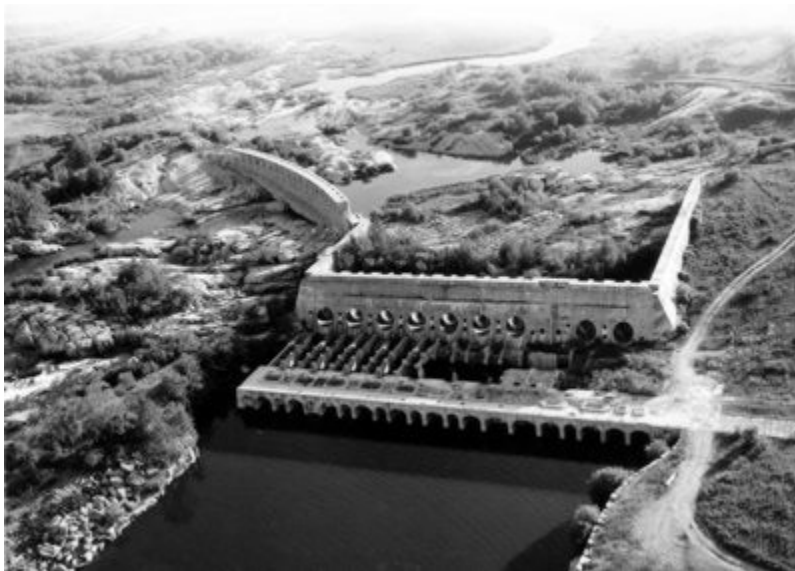
Pinawa Generating Station as it appears today, c. 1983.