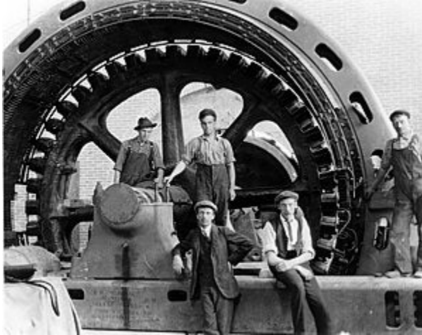
Interior view of a Pinawa generator c. 1906