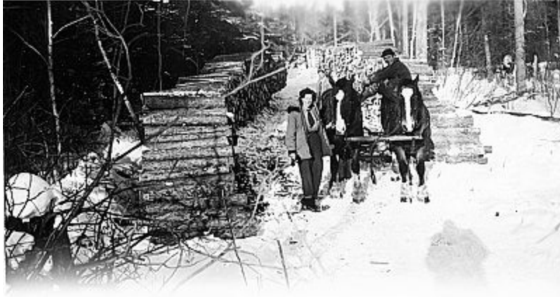
Wood was needed to heat the town of Pinawa, n.d.