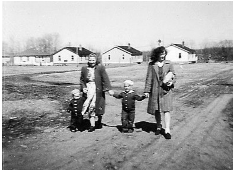
Out for a walk with three little ones: note the houses in the background, n.d.

There were about 20 families and several single people living in Pinawa. The population was near 100 most of the time. By 1919, the school, also used as the town hall, was no longer big enough to hold events, so a warehouse was renovated into the town hall.