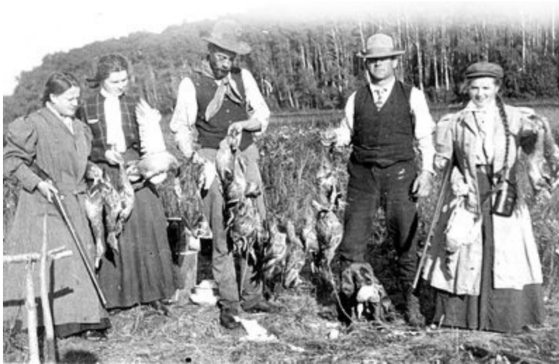
Nature provided for the early residents of old Pinawa, n.d.