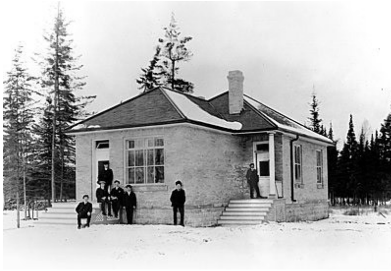
The company store, c. 1908.