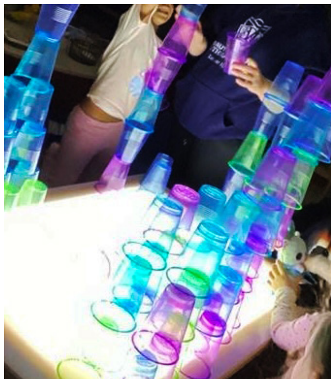
Children from Beautiful Saviour Lutheran Child Care take part in a variety of STEAM-focused activities and projects inside and outside, all year round.