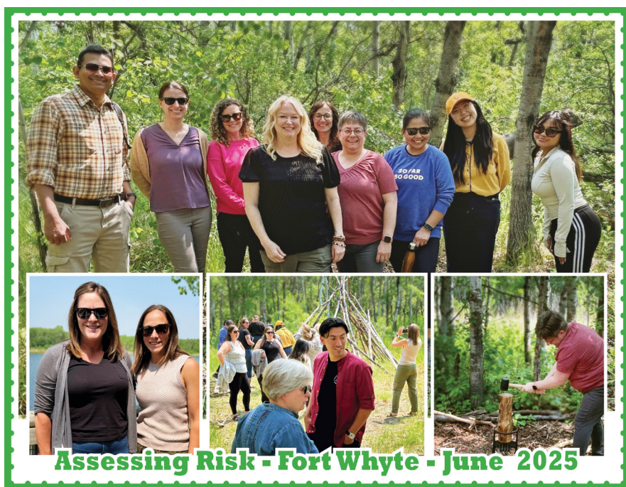
Assessing Risk - Fort Whyte - June 2025