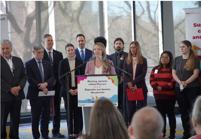
The Honourable Jenna Sudds, then Minister of Families, Children and Social Development of Canada speaks at the announcement on February 18, joined at her right by the Honourable Tracy Schmidt, Manitoba Education and Early Childhood Learning Minister.

A Request for Proposals was issued in October 2024 to develop 29 stand-alone child care centres on school property over the next two years leveraging modular building technology. A similar development method has been used to construct 22 high-quality child care facilities across the province through the Municipalities and Indigenous Governing Bodies' Ready-to-Move Child Care Initiative. These Ready-to-Move child care centres have been constructed in an average of nine months, from piles being poured to occupancy. An information session with participating school divisions will be organized in Spring 2025 to kick off the next phase of the School Based Child Care Expansion Project.