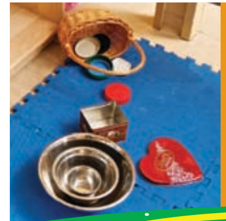
Infants do not need to be taught to use toys. Set out openended materials and watch children learn by exploring.

Part of your role as a caregiver is to watch, listen and be near infants for their safety, but also allow them to explore on their own or with peers without adult interruptions. Use this time to observe and document each child's learning and development in a non-intrusive way. Look at the child's face and the toy or object the