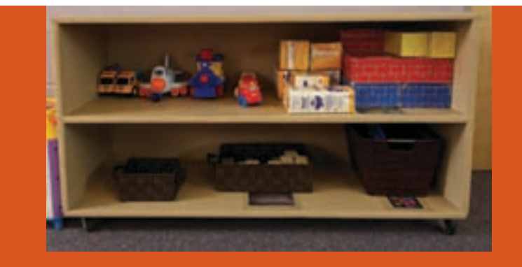
Arrange materials by type in open bins on low shelves so children can find play materials easily. Infants need to be able to explore on their own, by choosing where, what and how to play.

Your indoor environment should provide open, accessible space for children so they can discover and learn by using hands-on materials in play with peers. Defined space and organized materials provide indirect guidance and promote children's constructive play. You support independence by arranging materials by type in open bins on low shelves so children can find play materials easily. Infants need to be able to explore on their own, by choosing where, what and how to play.