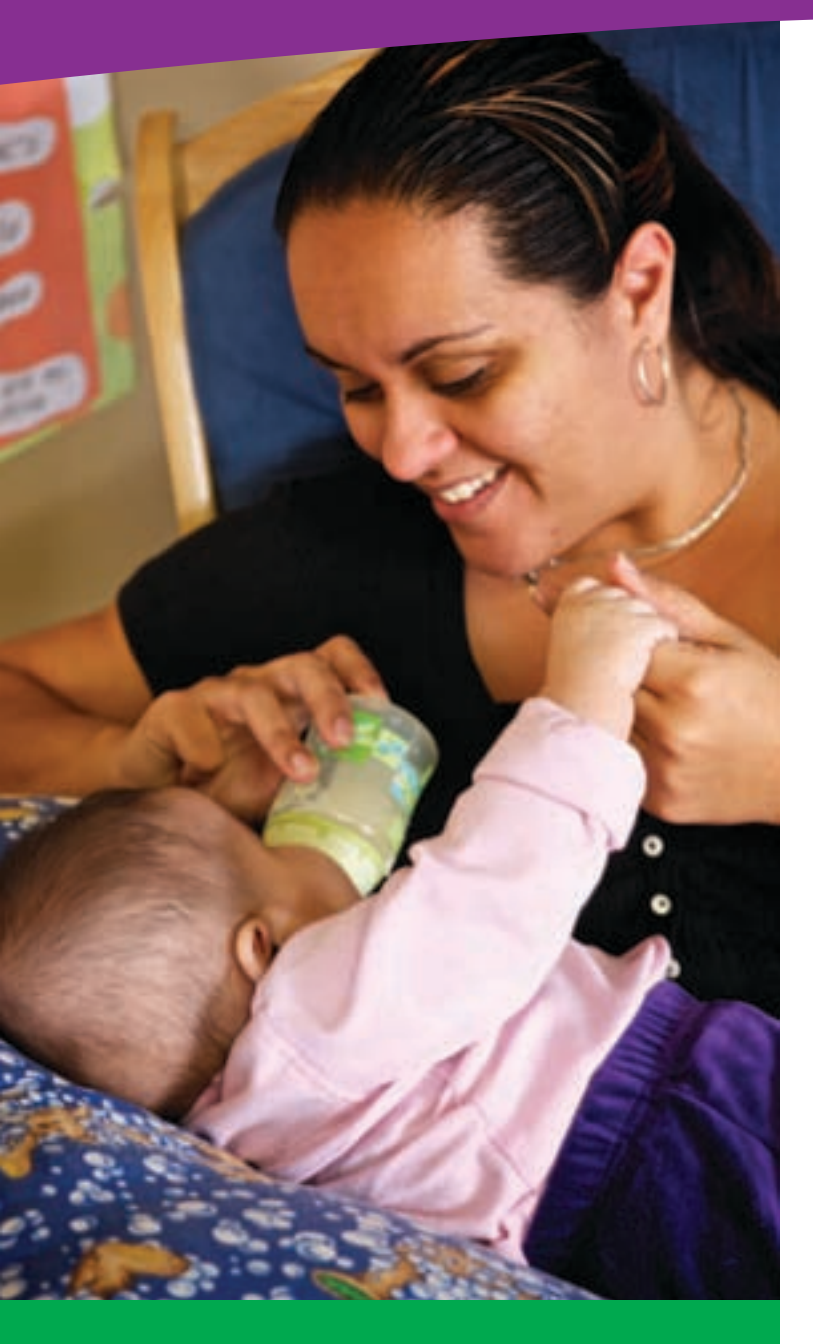
The caregiver is the most important 'ingredient' in any curriculum.