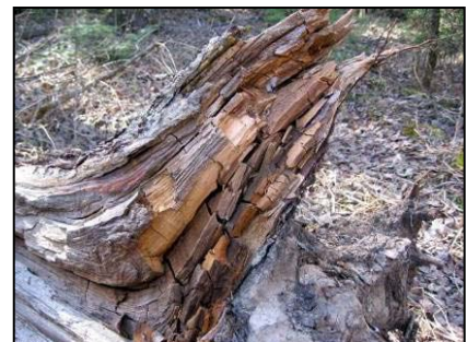
Figure 54: Brown cubical rot in roots

Brown cubical rot: This decay type occurs in all of the conifers. It is more common in red pine and white spruce than other conifers. For the most part, it is confined to the butt in all species. In the early stages softened wood is yellowish to light yellow-brown. It soon becomes dark brown and is separated into small, irregular, roughly cubical blocks (Figure 54) that are easily crushed to a powder between the fingers.