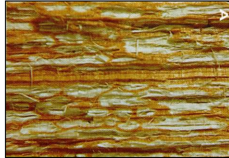
Figure 31: Close up of white pocket rot

Red heart rot: This type of decay is found in balsam fir. It accounts for over two-thirds of the advanced rot in this species. It is primarily a trunk rot, which in cross-section frequently occupies all or most of the heartwood. This decay is a medium to deep reddish-brown colour. It tends to remain in an intermediate stage between incipient and advanced decay for a relatively long period of time. In its later stages, it becomes stringy and crumbly in texture and tends to fade slightly in colour.