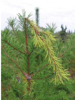
Figure 12: Late season eastern pine shootborer symptom

Management practices are similar to white pine weevil; however sanitation pruning of dying terminals should be timed for early summer. An experienced eye is required to detect an infested shoot as early symptoms of attack are difficult to identify. Advanced symptoms of shoot decline indicate the larva has girdled and exited the terminal. Pheromone trapping can be used in high value stands such as seed orchards and family tests to monitor the shootborer population.