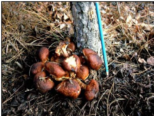
Figure 58: Root disease fruiting body