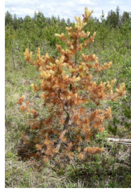
Figure 15: Advanced symptoms in jack pine