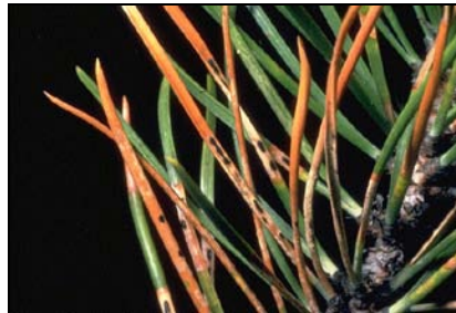
Figure 20: Pine needle cast fruiting bodies