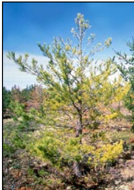
Figure 55: Root disease chlorosis

Armillaria spp. are complex fungi which can act as an aggressive killer of healthy trees, a secondary pathogen of stressed trees and as a beneficial saprophyte decaying dead plant material. Its role as a secondary pathogen is generally in over mature trees or in those stressed by other insects and disease or environmental conditions. Armillaria often acts as a primary pathogen on young reforested sites due to the large amount of inoculum present on the decaying root systems of the previous stand.