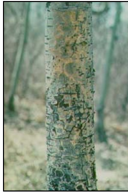
Figure 64: Hypoxylon canker conidial blisters