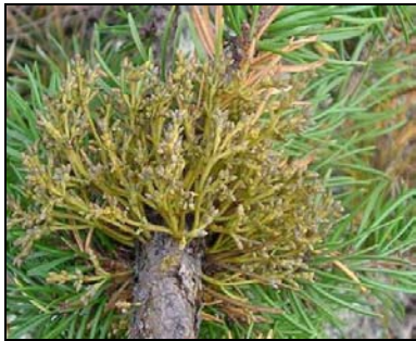
Figure 27: Dwarf mistletoe aerial shoots on pine