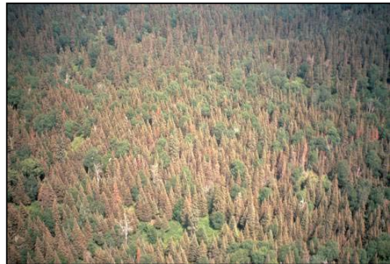
Figure 2: Severe spruce budworm defoliation – scorched appearance