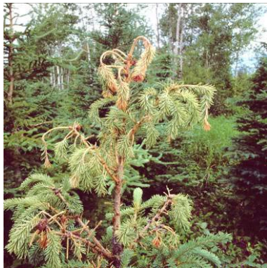
Figure 7: White pine weevil exit shepherd's crook

regenerating white pine. It is also an important pest of young spruce plantations in western Canada. It predominantly attacks trees between the ages of five to 35 years.