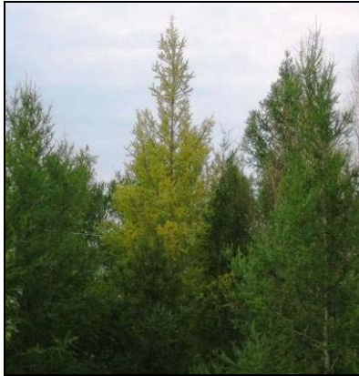
Figure 13: Larch declining due to eastern larch beetle

The eastern larch beetle, Dendroctonus simplex occurs throughout the range of tamarack, which includes northeastern United States, much of Canada and into Alaska. In Manitoba, localized outbreaks have occurred in the past. However, an outbreak which commenced in 2001 has expanded throughout much of tamarack's range within southeastern Manitoba and the boreal plain forest. Three successive winters with above normal temperatures, resulting in increased larval and pupal survival, combined with excessive precipitation increasing tree stress, are contributing factors to this widespread outbreak.