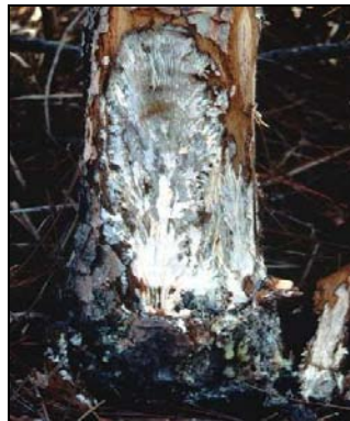
Figure 57: Root disease mycelial fan