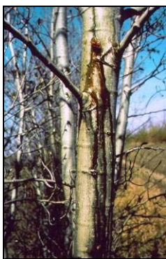
Figure 18: Poplar borer damage

The poplar borer, a round-headed wood borer, ranges across North America wherever host species occur. Trembling aspen is a preferred host, but many other poplars and willows are susceptible to attack.