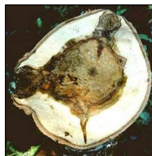
Figure 62: White trunk rot - advanced decay