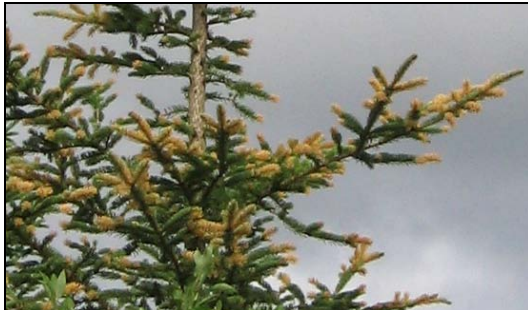
Figure 23: Spruce needle rust symptoms on spruce

Chrysomyxa ledi and C. ledicola are common spruce needle rusts in Manitoba.