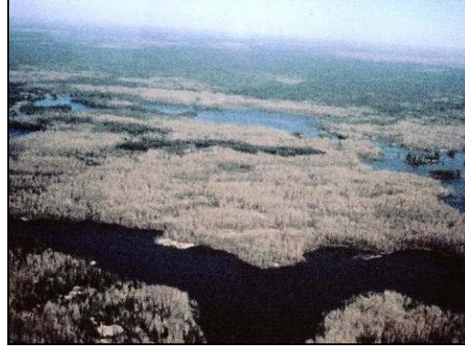
Figure 17: Forest tent caterpillar – aerial view of widespread severe defoliation