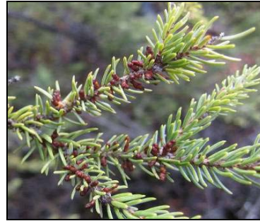
Figure 26: Dwarf mistletoe aerial shoots on spruce