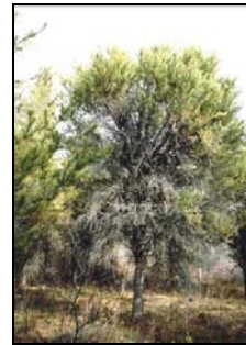
Figure 28: Deformed dwarf mistletoe infested pine