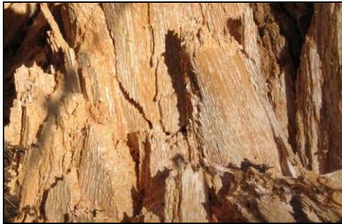
Figure 30: White pocket rot in stump

White (red) pocket rot: This type of decay occurs in pines and spruces. It accounts for approximately one-half of the decay found in pines and white spruce and one-third of the decay found in black spruce. It is primarily a trunk rot ( Phellinus pini ) of white and jack pine but is more common as a root and butt rot ( Inonotus tomentosus ) of red pine and white spruce. This decay appears as lens-shaped cavities parallel to the grain. These cavities are sometimes empty, but are most often filled with a white fibrous mass of almost pure cellulose, surrounded by firm light red to reddish-brown wood (Figures 30 and 31). Black, irregular-shaped zone lines are occasionally present in the decayed wood.