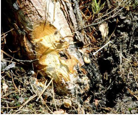
Figure 14: Resinosis and larva - pine root collar weevil