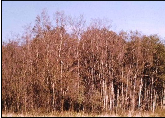
Figure 16: Forest tent caterpillar defoliation