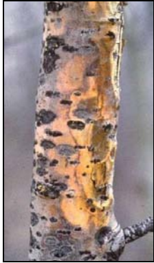
Figure 63: Hypoxylon canker vegetative stage

Hypoxylon canker, Hypoxylon mammatum (Wahl.) Mill., is present throughout the range of trembling aspen, its major host species. This disease also affects other poplars including largetooth aspen and balsam poplar. Hypoxylon canker is the most damaging disease of young and intermediate age aspen.