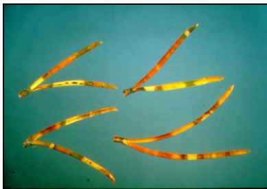
Figure 19: Pine needle cast banding

There are many native pine needle casts and some introduced. Lophodermium pinastri , Lophodermella concolor and Cyclaneusma minus are pine needle casts that have caused noticeable damage on occasion in Manitoba. Field identification of the species of needle cast is difficult.