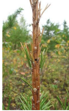
Figure 11: Exit hole of emerging adult weevil