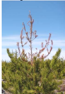
Figure 8: Late season white pine weevil symptom