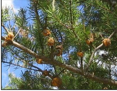
Figure 29: Galls on infected pine branches