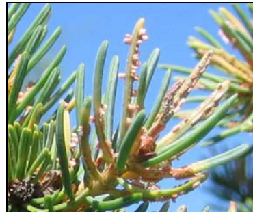
Figure 24: Spruce needle rust, sporulation on spruce