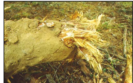
Figure 53: Yellow stringy butt rot

Yellow stringy (white stringy) butt rot: This decay is present in all conifers, but occurs in relatively small amounts in pines. It is primarily a butt rot. Affected wood becomes yellow or yellow-brown with the formation of pockets in the springwood. The pockets frequently coalesce causing separation of the annual rings. As the decay progresses, the wood is reduced to a loose, stringy mass of orange-yellow fibres (Figure 53). In the more advanced stages, empty cavities exist in the centre of the bole.