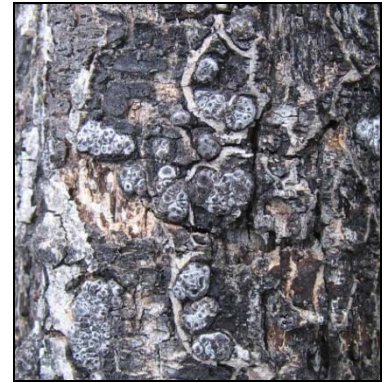
Figure 65: Hypoxylon canker perithecia