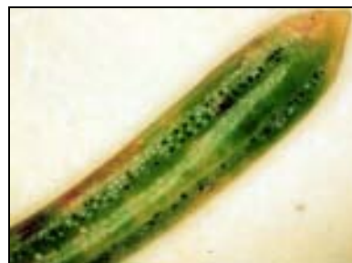
Figure 22: Stigmina needle cast fruiting bodies