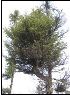
Figure 25: Witches broom on black spruce

Dwarf mistletoe on jack pine is widespread in the Interlake, northwestern Manitoba and Belair Provincial Forest. It also occurs in western Manitoba in the Cowan area and Porcupine Provincial Forest. Dwarf mistletoe on spruce occurs in southeastern Manitoba, east of Lake Winnipeg, in the Interlake, Spruce Woods, western and northwestern Manitoba.