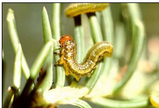
Figure 5: Yellowheaded spruce sawfly larva

The yellowheaded spruce sawfly, Pikonema alaskensis , is native to North America. It ranges from coast to coast in Canada and into the Northwest Territories. Its hosts include all native and exotic species of spruce. In Manitoba it attacks white and black spruce and the introduced Colorado blue spruce.