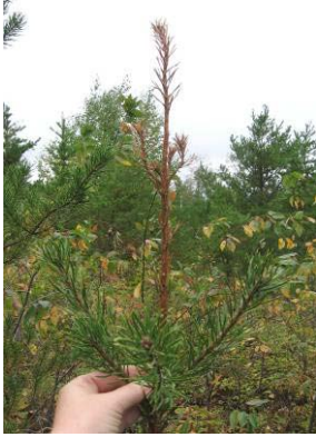
Figure 10: Late season terminal weevil Symptom on current leader