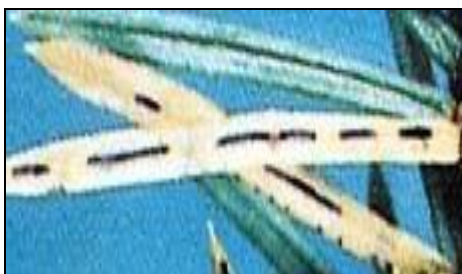
Figure 21: Lirula needle cast fruiting bodies

Lirula , Stigmina and Rhizosphaera needle casts are common on spruce in Manitoba. The fruiting bodies produced on the needles are used for species diagnosis.