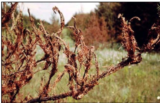
Figure 3: Partially consumed needles clipped and webbed to shoot with frass and a pupal case

Jack pine budworm, Choristoneura pinus pinus (Freeman) is a major pest of pines in the Great Lake States of Michigan, Wisconsin and Minnesota, central and northwestern Ontario, Manitoba, and Saskatchewan. Severe outbreaks seriously affect the growth and quality of vast areas of pine. Jack pine is the favoured host, but red pine, Scots pine, lodgepole and occasionally white pine can be seriously defoliated when growing near susceptible jack pine.