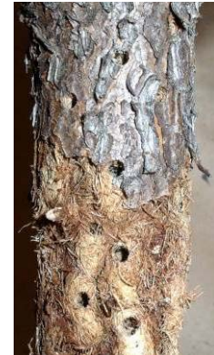
Figure 9: Adult weevil holes with chip cocoons