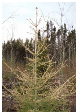
Figure 6: Yellowheaded spruce sawfly severe feeding damage