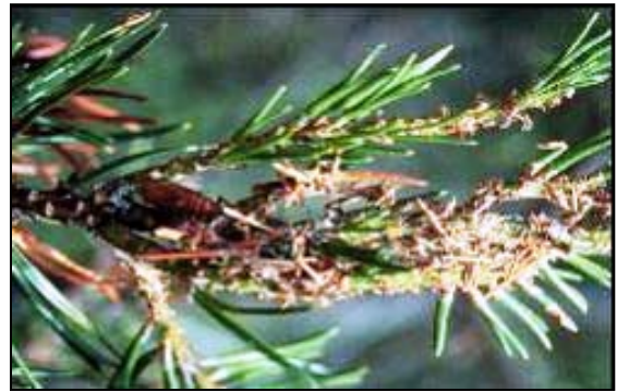
Figure 4: Severe jack pine budworm defoliation – scorched appearance