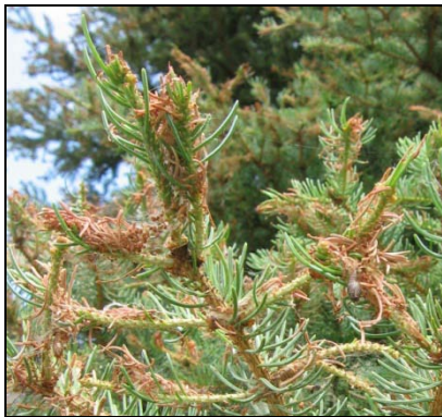
Figure 1: Larval frass and clipped needles webbed to partially consumed shoots

Eastern spruce budworm, Choristoneura fumiferana , is the most destructive and widely distributed forest defoliator in North America ranging from Newfoundland to Alaska. The destructive phase of this pest is the larval or caterpillar stage. In Manitoba, the budworm feeds on white spruce, balsam fir and to a lesser extent black spruce.