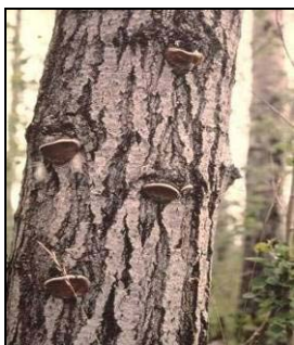
Figure 61: White trunk rot conks

White trunk rot of aspen is caused by the fungus Phellinus tremulae . It is the most important decay-causing fungus of aspen in the Prairie Provinces.