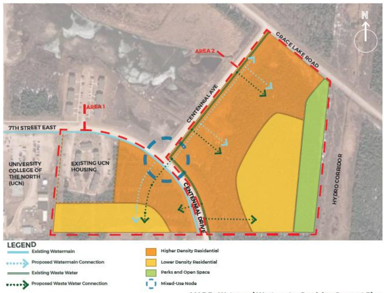
MAP 3 - Water and Wastewater Servicing Concept Plan