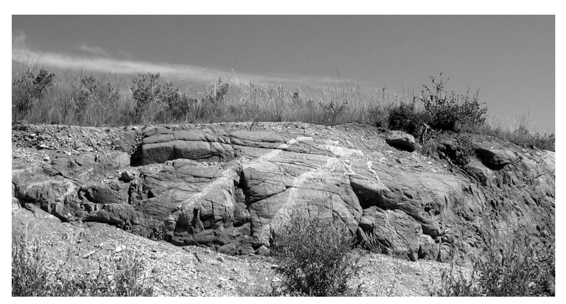
Figure GS-29-2: Precambrian bedrock exposed in gravel pit in SW-10-33-7-W1.

The Elm Point Formation is a facies equivalent of all or part of the Lower Member of the Winnipegosis Formation