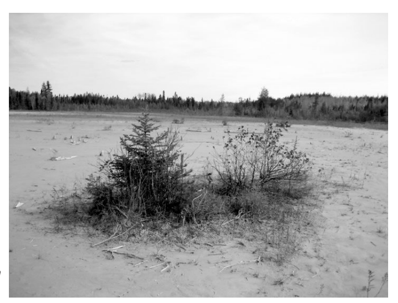
Figure GS-21-1: Isolated plant growth on Gunnar minesite tailings.

<sup>1</sup> University of Manitoba, Department of Botany, Winnipeg, Manitoba, R3T 2N2