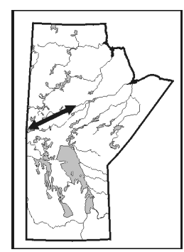
Figure GS-6-1 is a generalized map of the Trans-Hudson Orogen on which we

have plotted, in a generalized way, most of the localities at which we collected samples. Our general goals were to sample all the way across the orogen, being sure that we sampled each of the terranes within it. We collected a total of 110 samples, comprising plutons, pegmatites, and metasedimentary rocks. We did not sample metavolcanic rocks because we considered it unlikely that, other than zircon, they would yield the minerals we needed (as outlined above).