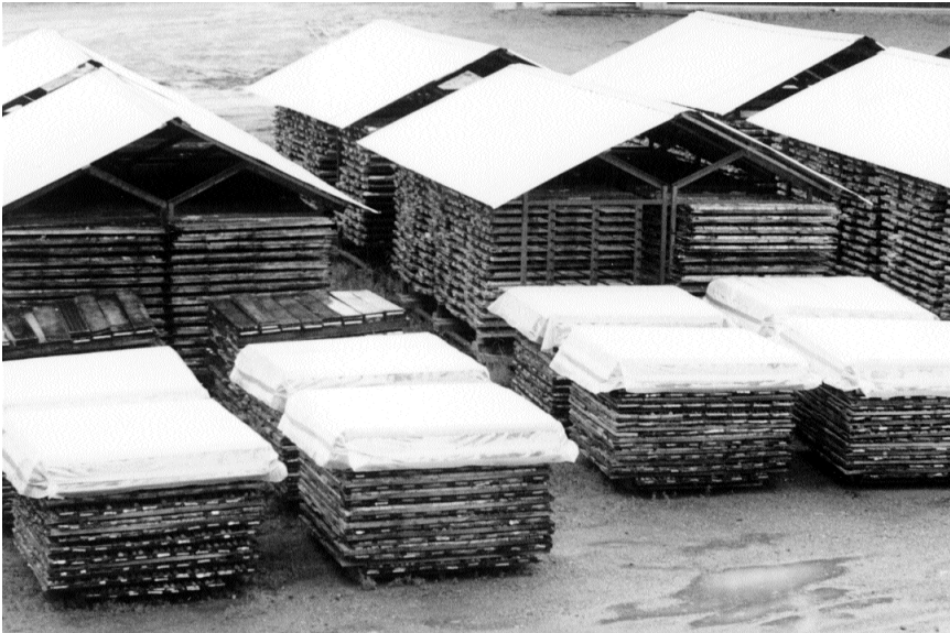
Figure GS-5-5: Another portion of stored core at Wabowden.