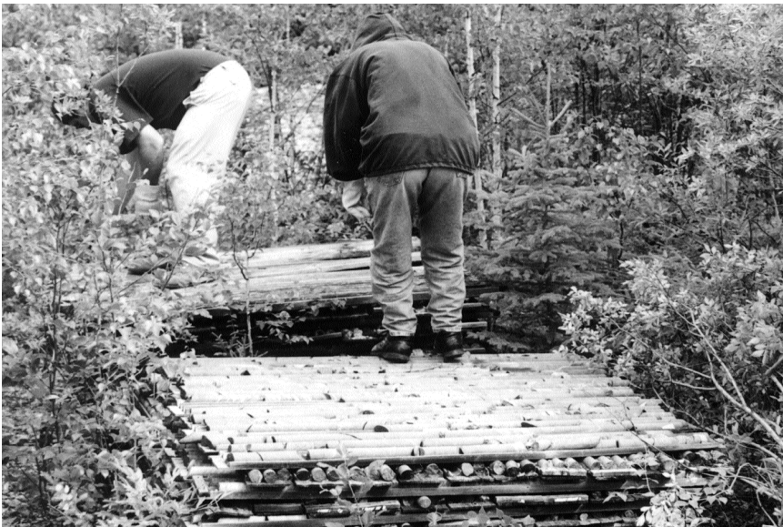
Figure GS-5-2: Retrieving the cross-piled core from the bush at Bucko.