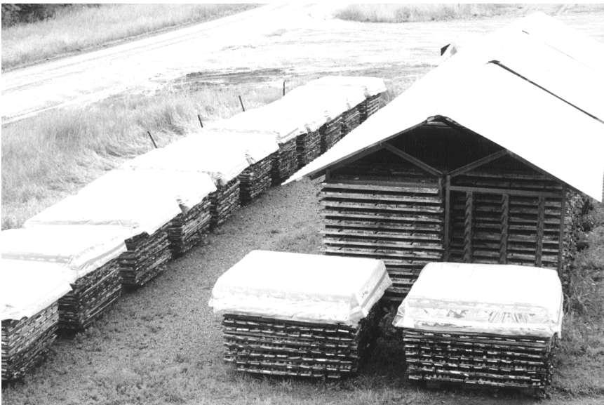
Figure GS-5-4: A portion of retrieved core stored in Wabowden. Note plastic cover for protection against rain and snow.