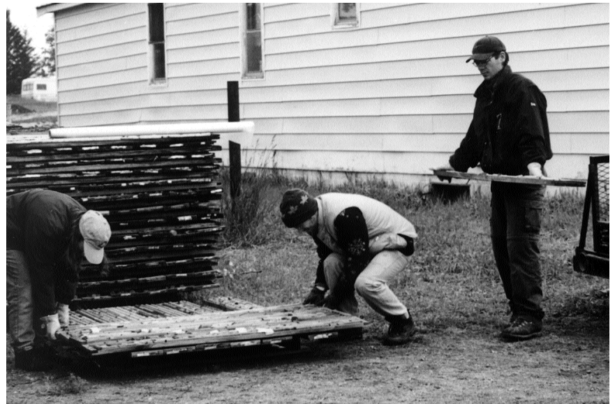
Figure GS-5-3: Storing retrieved core at new location in Wabowden.