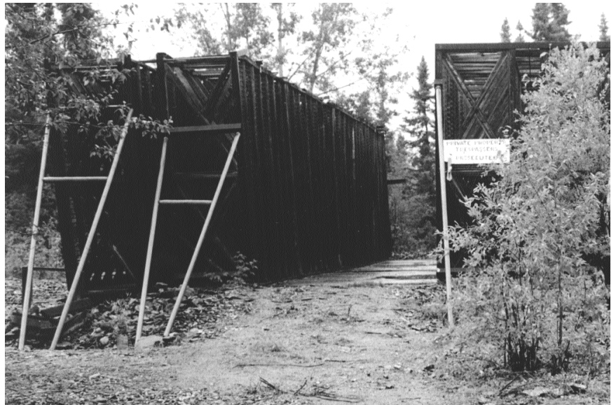
Figure GS-5-6: Empty core racks before dismantling at cleaned Bucko site.