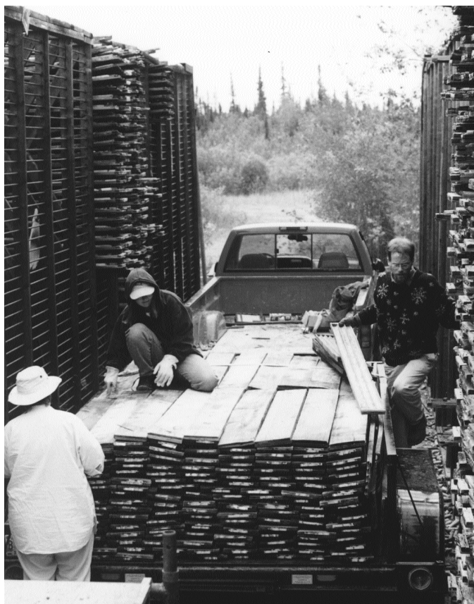
Figure GS-5-1: Retrieving the core from core racks at Bucko.