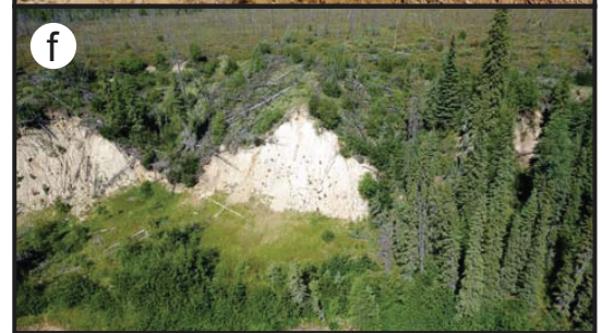
Figure 5: Quaternary stratigraphy present at section 112-16-401: a) Stratigraphic log of section 112-16-401. Till sample numbers are in white boxes. Munsell colour from Munsell Color–X-Rite, Incorporated (2015); b) View from river level of the exposed Quaternary sediments; c) Brown diamict logged at the section; d) Light olive brown diamict logged at the section; e) Diamict and sand sequence from 5.0–6.8 m bgs; f) Oblique aerial view of the exposed Quaternary sediments.