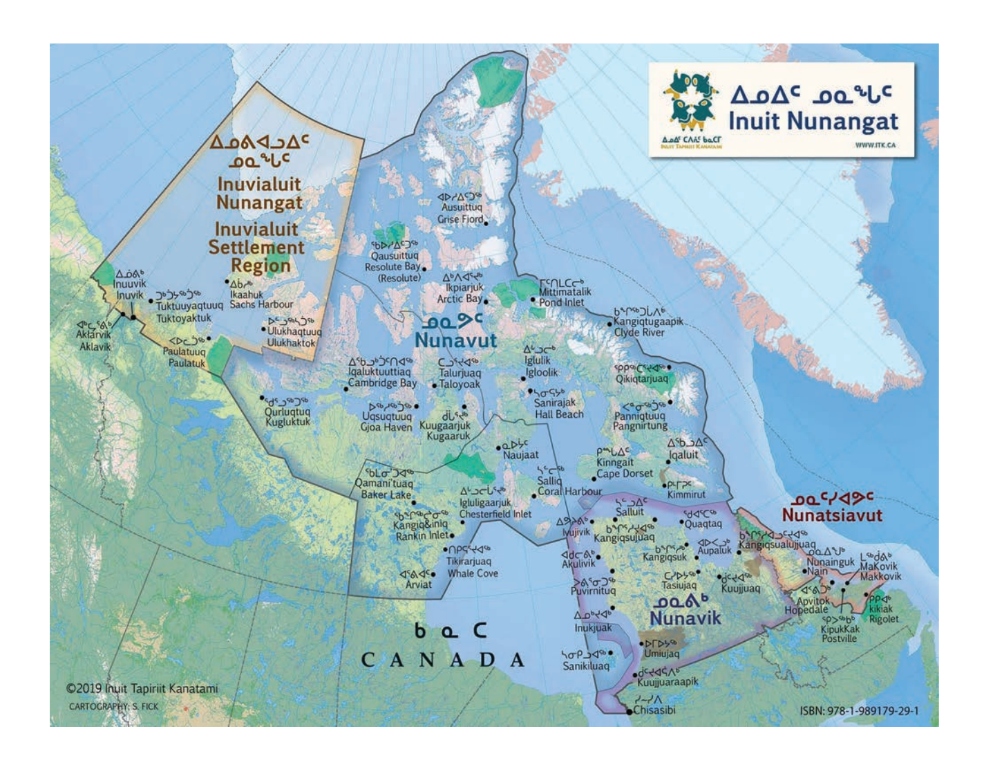
Figure 2: Inuit Nunangat is the Inuit homeland, encompassing 51 communities across the Inuvialuit Settlement Region, Nunavut, Nunavik, and Nunatsiavut