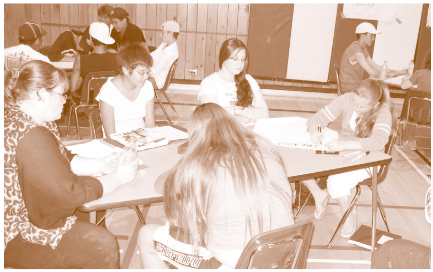
Small group work – developing daily, weekly and monthly summer youth activity plans.