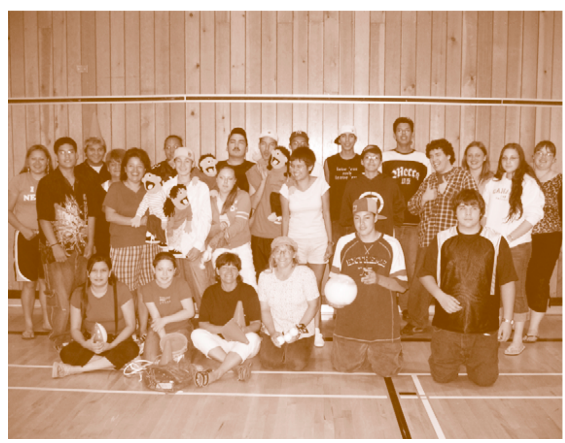
Workshop participants gather at the end of day two.