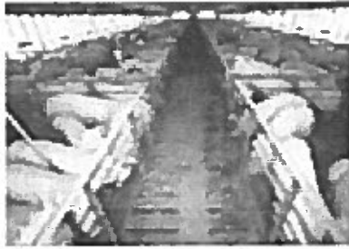
Pigs in a CAFO

The environmental impact of pig farming refers to the threats posed to the natural environment by large-scale pig farming. Industrial pig farming, a subset of concentrated animal feeding operations, poses numerous threats to the environment. CAFOs house thousands of swine and other farm animals in confined areas, where feces and waste often spread to surrounding neighborhoods, polluting air and water with toxic waste particles. [1] Waste from these farms have the potential to carry pathogens, bacteria (often antibiotic resistant), and heavy metals that can be toxic when ingested. [2] Pig waste also contributes to groundwater pollution in the forms of groundwater seepage and waste spray, which is essentially the usage of a sprinkler to spray vats of pig waste into neighboring areas. The contents in the spray and waste drift have been shown to cause mucosal irritation, [3] respiratory ailment, [4] increased stress, [5] decreased quality of life, [6] and higher disease prevalence. [7] The