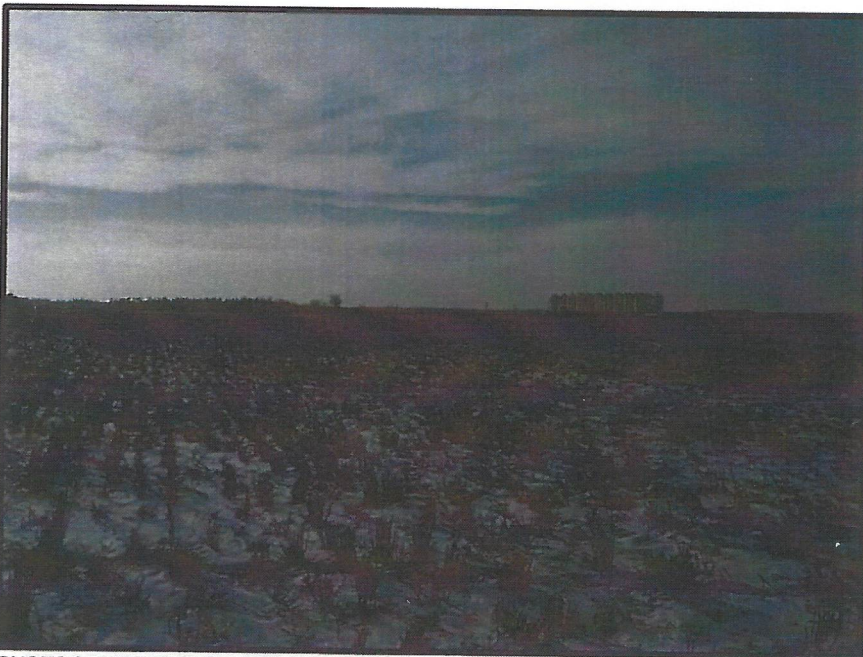
PHOTOGRAPH #4: FACING SOUTHWEST SHOWING THE EXISTING SITE CONDITIONS ALONG WEST PROPERTY BOUNDARY