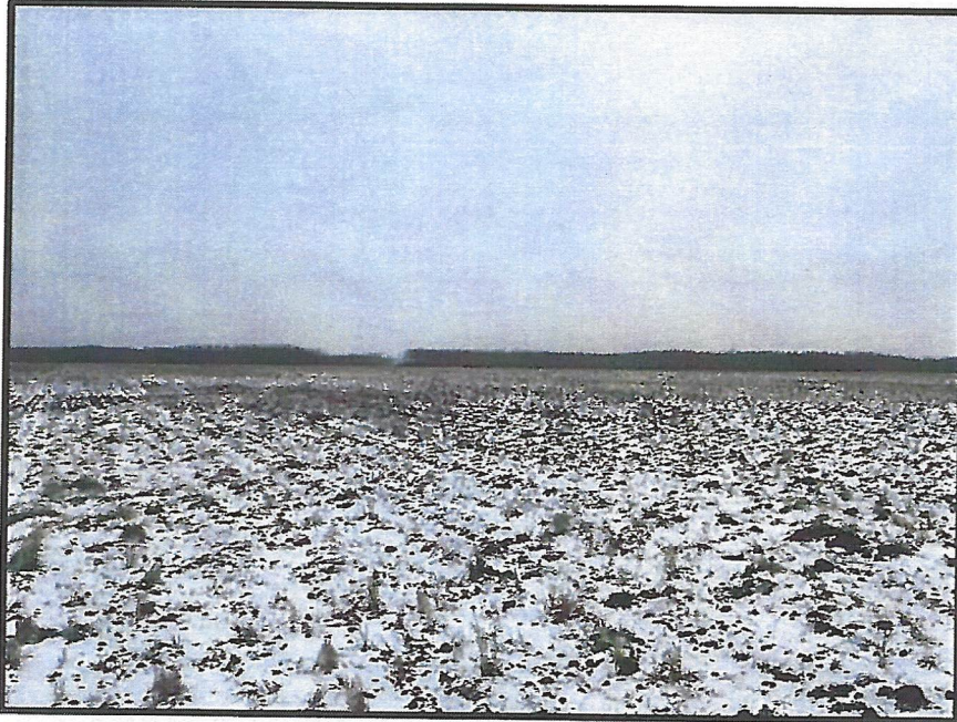
PHOTOGRAPH #1: FACING NORTH, SHOWING THE EXISTING SITE CONDITIONS NEAR THE WEST PROPERTY BOUNDARY.