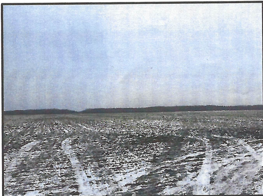
PHOTOGRAPH #2: FACING NORTH, SHOWING THE EXISTING SITE CONDITIONS ALONG MID-POINT OF THE PROPERTY.