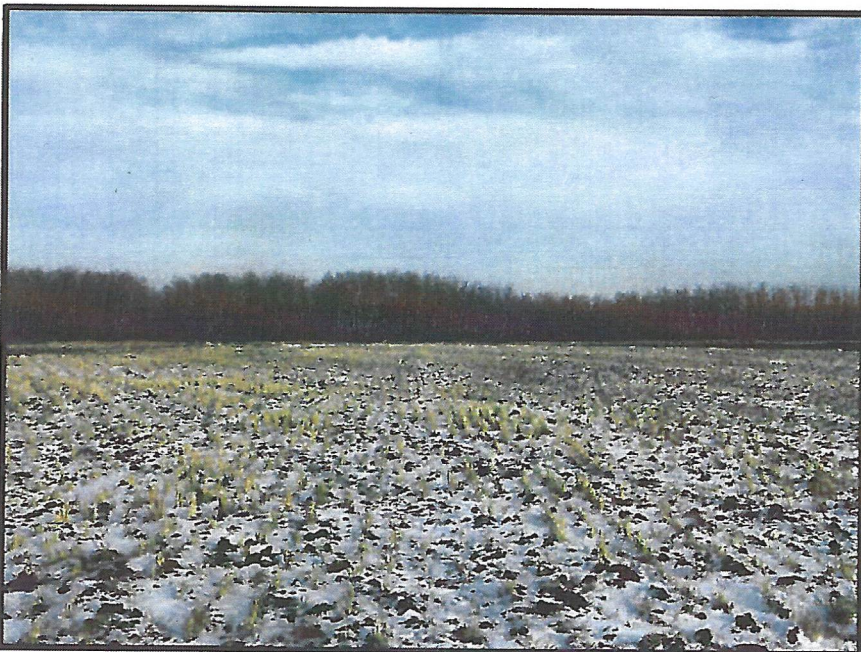
PHOTOGRAPH #6: FACING NORTHEAST, SHOWING THE EXISTING SITE CONDITIONS AND TREE LINE ALONG THE NORTH AND EAST PROPERTY BOUNDARY.

No. DATE ISSUE /REVISION 0 APR. 2021 construction