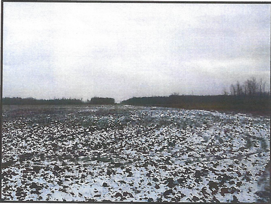
PHOTOGRAPH #3: FACING NORTH, SHOWING THE EXISTING SITE CONDITIONS ALONG EAST PROPERTY BOUNDARY.