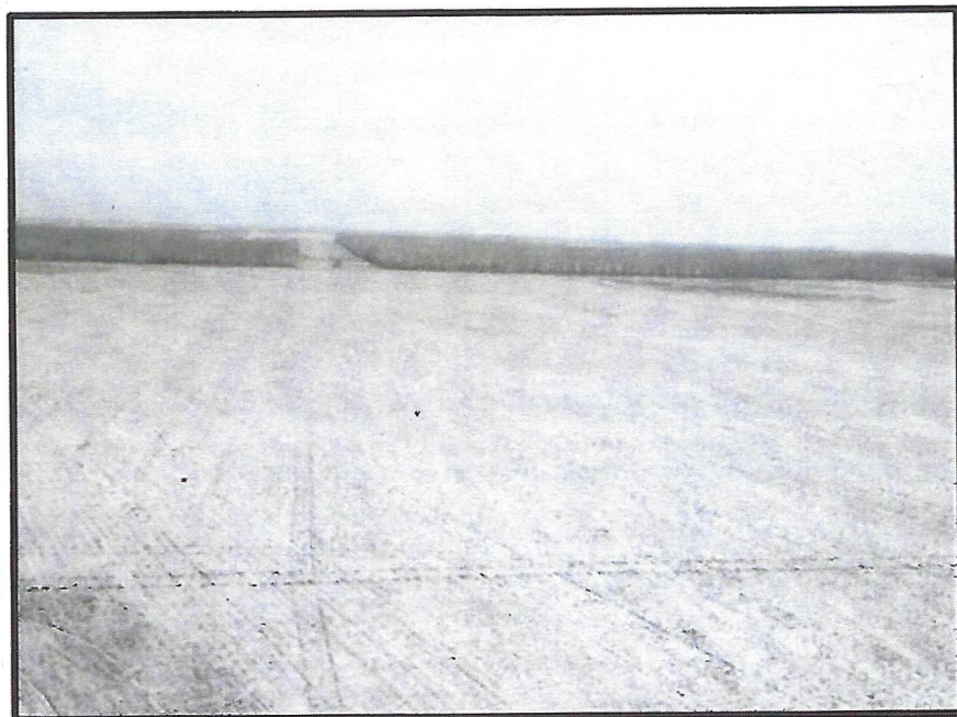
PHOTOGRAPH #5: FACING NORTH, SHOWING AERIAL VIEW OF THE PROPOSED DEVELOPMENT AREA.