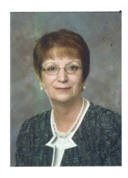
Eilleen Clarke Minister Indigenous and Municipal Relations