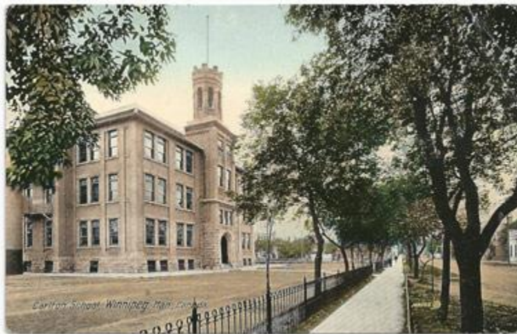
Early image (approx. 1910) of Carlton School in Winnipeg

“Civic beautification became entrenched in the 1890s when business leaders and urban reformers pressured city authorities to introduce urban parks and a coordinated approach to boulevard planting. Between 1893 and 1914, twenty-seven civic and three private parks were established within the city of Winnipeg. The prototypes for these parks and their counterparts in other prairie cities were usually a combination of English picturesque and formal Victorian landscaping conventions, and functioned to inculcate the British connection in the emerging prairie society.”