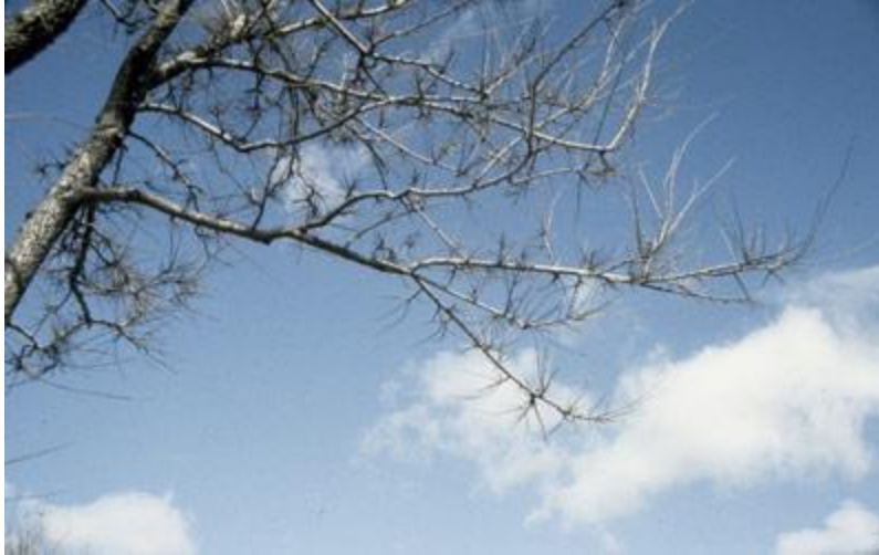
Tree damaged by road salt