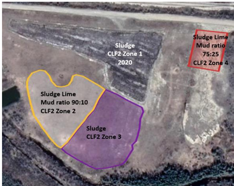
Figure 1: Capped Landfill 2 (CLF2) sludge lime mud trial locations. CLF2 Zone 2 sludge lime mud ratio 90:10 represented by the yellow polygon. CLF2 Zone 4 sludge lime mud ratio 75:25 represented by the red polygon.