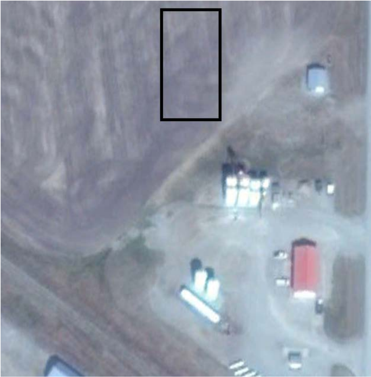
Proposed Fertilizer plant