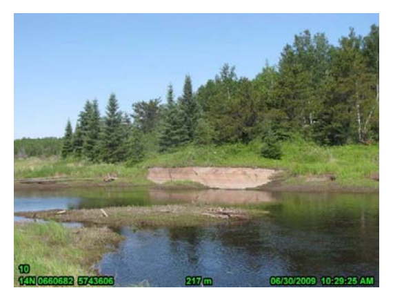
Proposed Steeprock Creek Crossing Location Near Hollowater First Nation

The aquatic biology assessment focused on the evaluation of the fisheries habitats and fisheries resources with respect to: