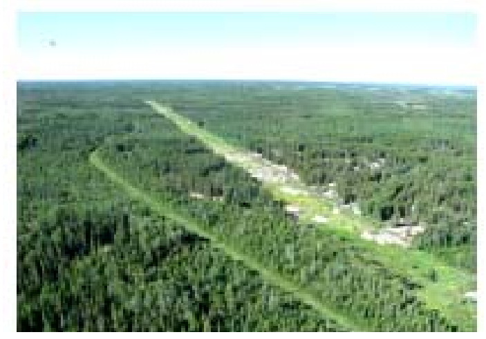
Existing Distribution Line and Winter Road, South of Berens River

The evaluation of the Natural Environment Criteria Category identified little significant difference in the actual number of water courses crossed by the three routes. Each route crosses three rivers requiring bridge structures more than 30 m in length. The Inner Shoreline requires the largest number of moderate-sized bridge structures ranging between 15 and 30 m in length. The Shoreline Route has the greatest number of bridges with multiple spans that require piers to be placed in the watercourse. The Central Route crosses the most wetland (shrub & herb) habitat and more open coniferous forest that presents habitat conditions favourable to woodland caribou. The Central Route would result in the highest disturbance to caribou habitat. Overall, despite the potential for more bridge spans, the Shoreline Route was favoured from the natural environment perspective as it does not cross critical caribou habitat, and any adverse effects to fish habitat from waterway crossings are considered to be mitigable.