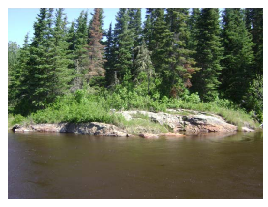
Berens River Bridge Site North Side

Construction phase activities are expected to commence in the fall of 2010, and should last approximately 42 months, with substantial completion targeted for March 2014.