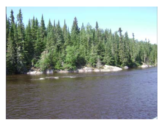
Berens River Bridge Site South Side

The proposed Project may be at risk of flooding due to seasonal flood events. However, the Project design standard of 1:100 year flood event for crossings is intended to limit the potential for flood damage and washouts at crossings and along the road network. In addition, the road will also include regular road side drains and culverts to accommodate seasonal drainage.