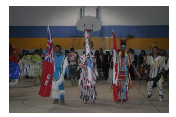
Pow Wow, Little Grand Rapids

Archaeological sites have been predominantly found along waterways and well-travelled trails in the region. In the region, as well as the project area, more sites have been found in the south and east as the northern areas are generally less accessible. North and east of Berens River, 11 pictographs, two (2) campsites and one (1) historic site have been found. In the general area from Bloodvein First Nation to Hollow Water First Nation, two petroforms, one (1) campsite and one (1) isolated find have been recorded. (Bulloch et al. 2002)