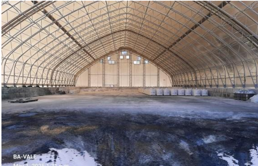
Figure 2: Stockpile Storage Tent

Figure 2 below provides a view of the Stockpile Storage Tent's interior.