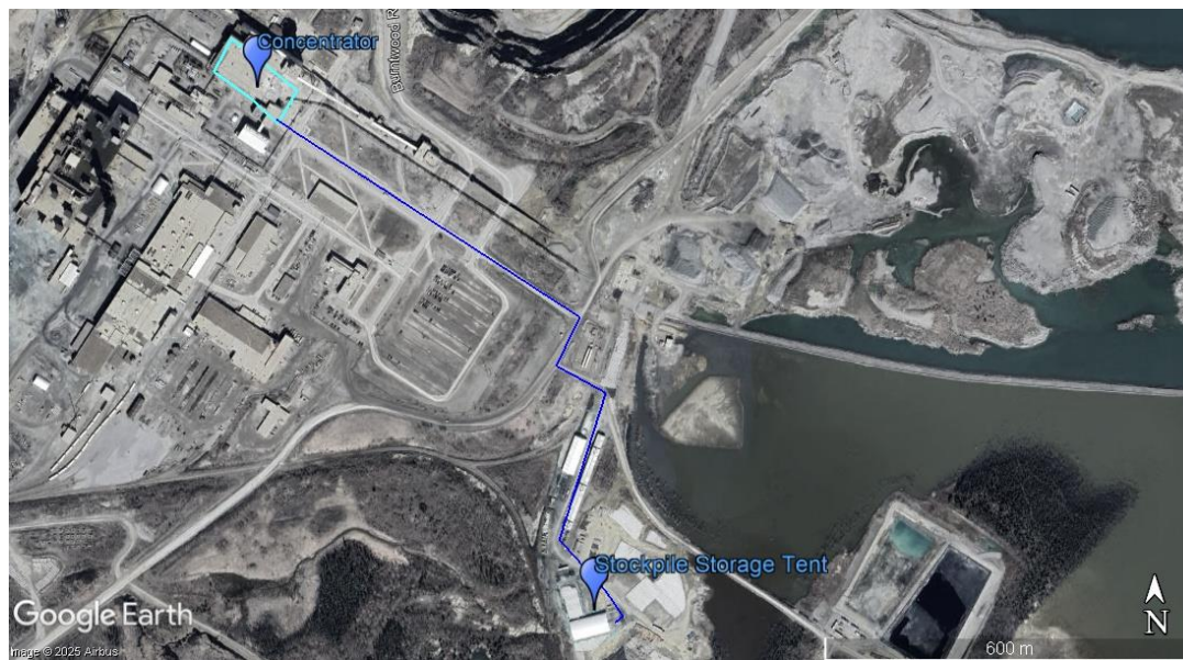
Figure 1: Thompson Complex Site Plan

Figure 1 below provides an overview of the location of the tent.