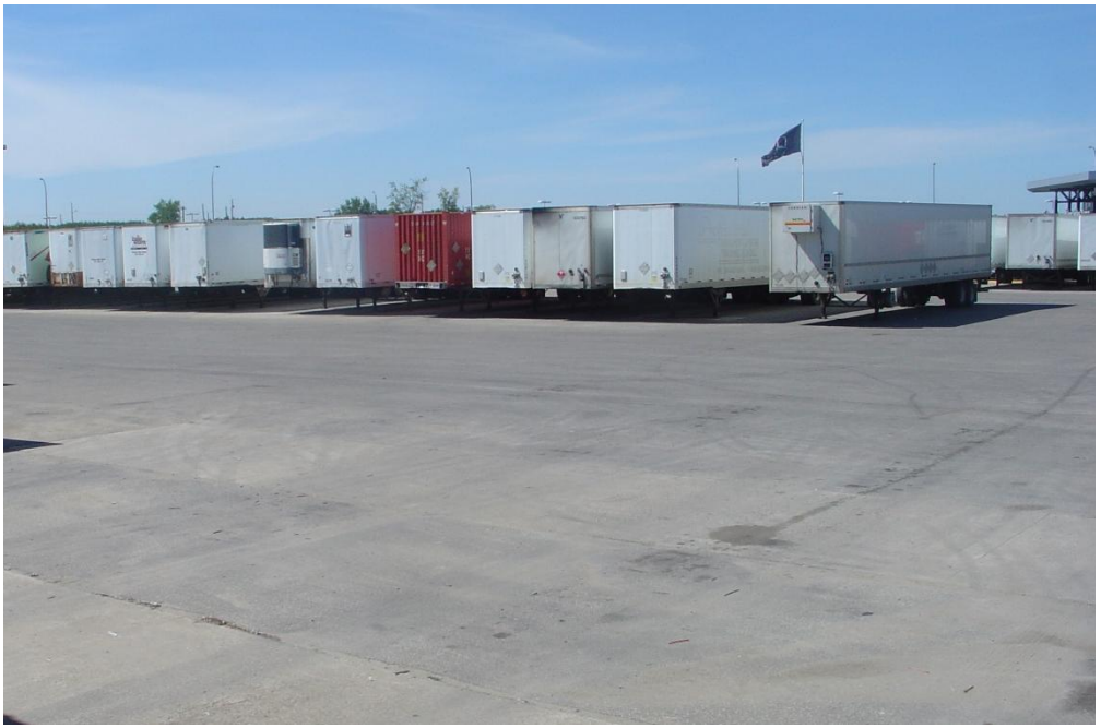
Figure 2: Trailer holding area. Note concrete surface, evidence of staining.