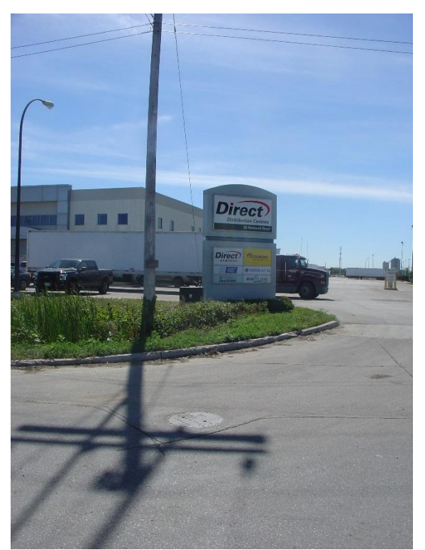
Figure 1: Entrance to Direct LP at 55 Rothwell