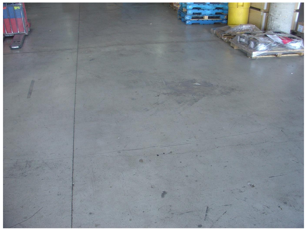
Figure 4: Floor in area where batteries were wrapped on pallets. Staining visible on floor is not related to battery operation.