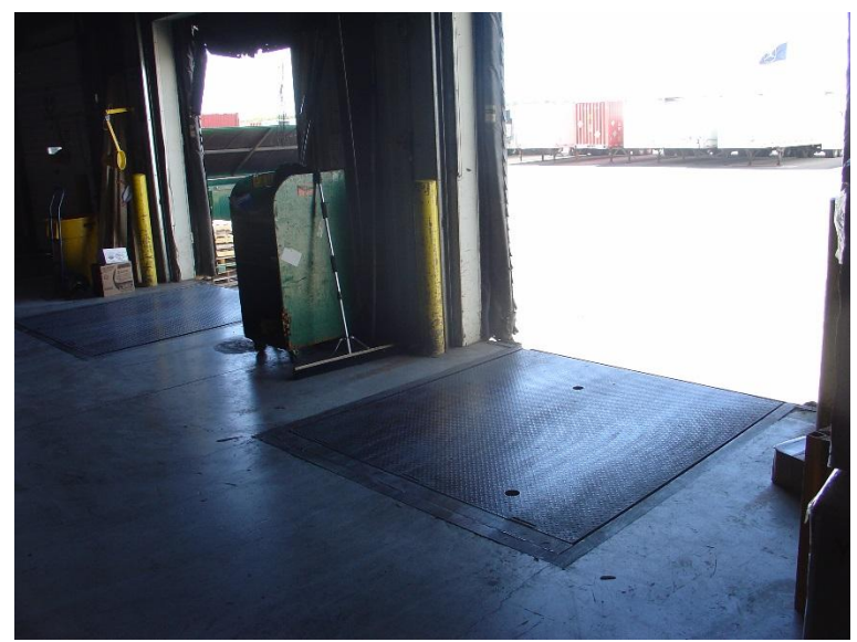
Figure 3: Loading and unloading dock areas that were used for battery transfer.