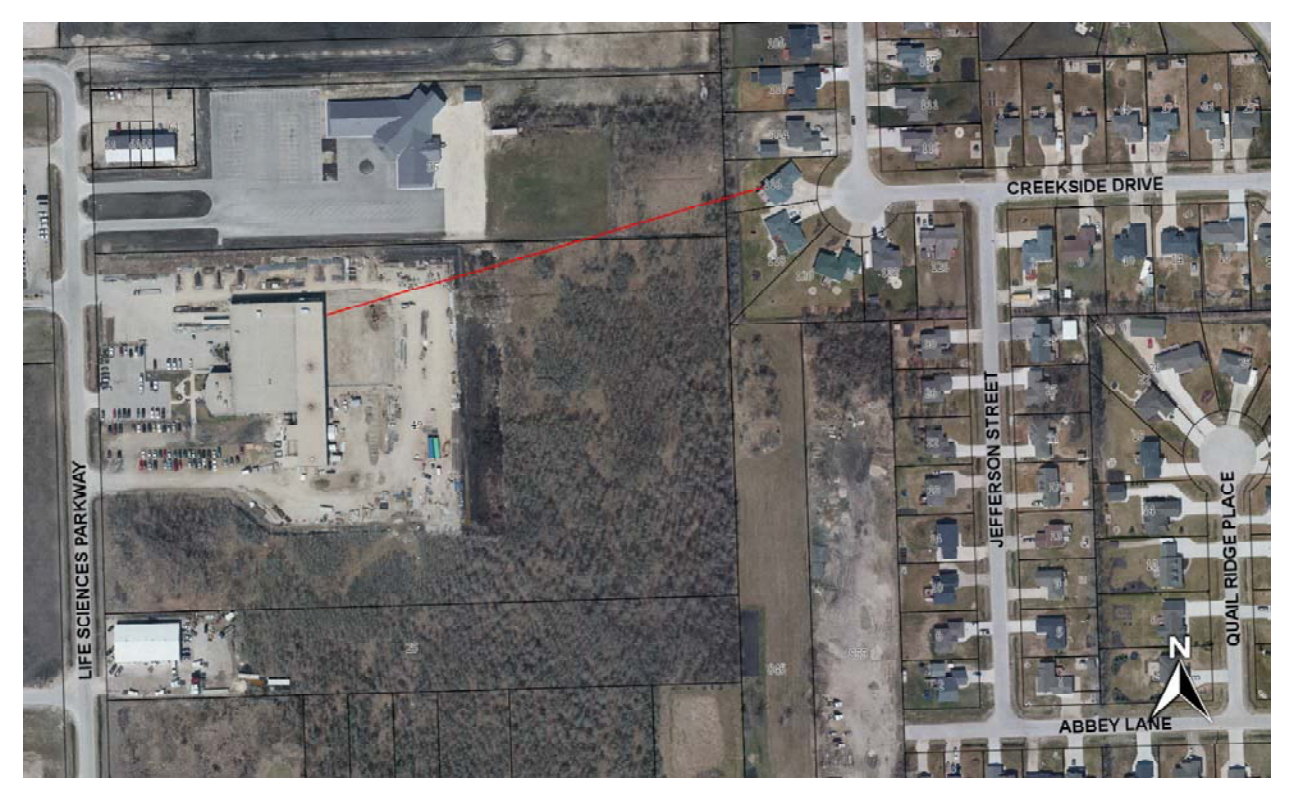
Distance from facility to housing is approximately 250-300 meters