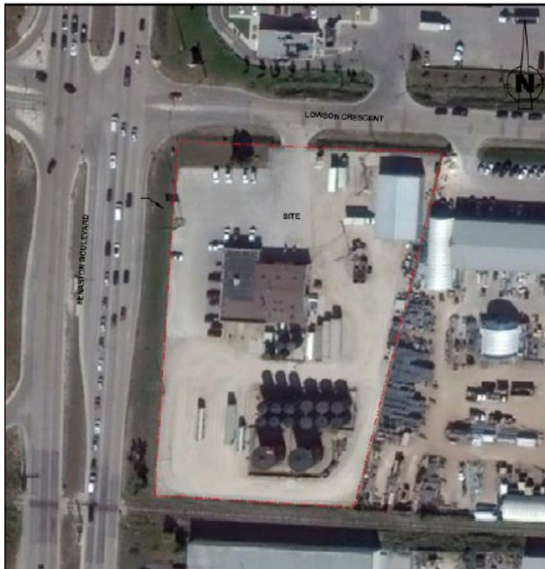
Figure 1 Facility Layout