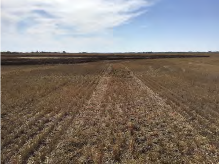
27. Wetland A-116, looking south October 1, 2021.