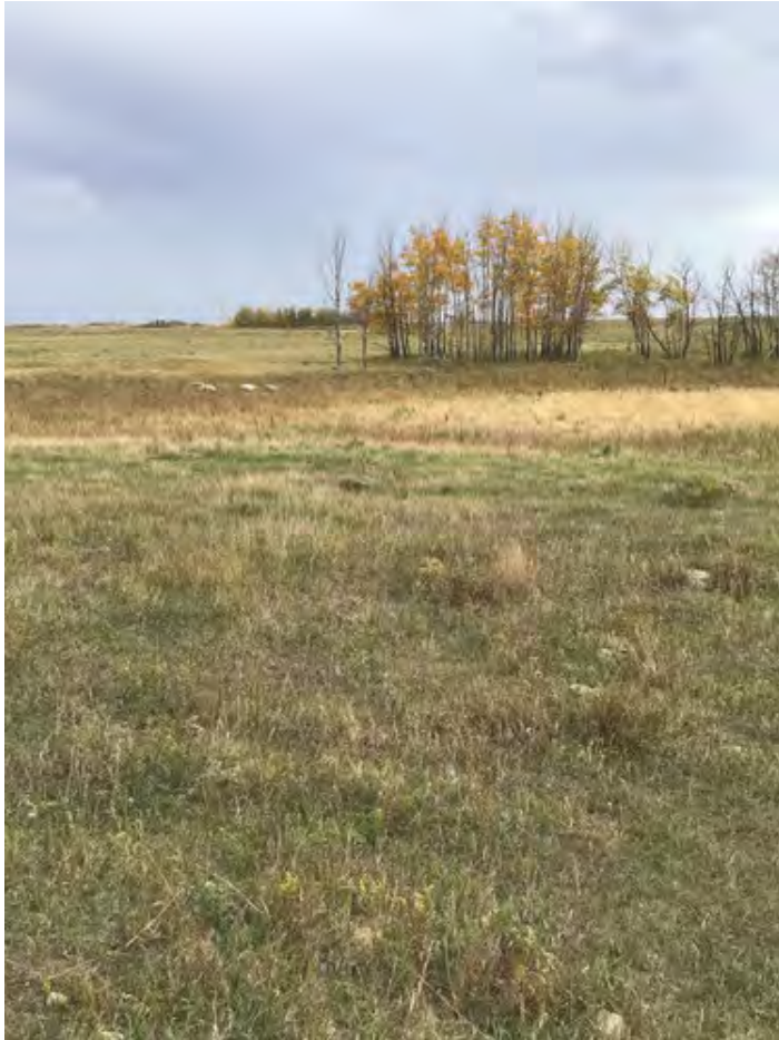
15. Wetland A-49, looking south October 1, 2021.