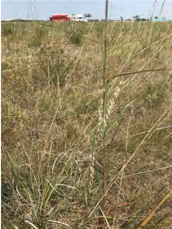
7. Side-oats grama ( Bouteloua curtipendula ) on modified/native grassland looking north July 30, 2021.