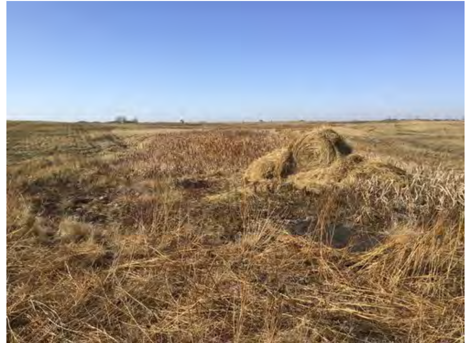
16. Wetland A-63, looking south October 1, 2021.