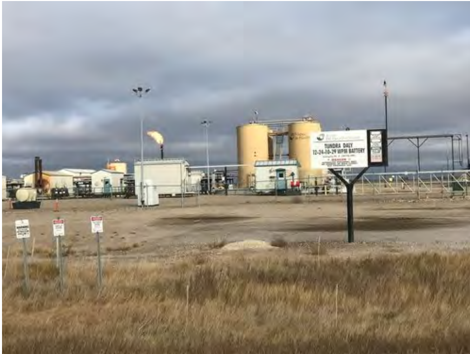
11. Looking east toward Tundra Daly 12-24-010-29 W1M battery site.