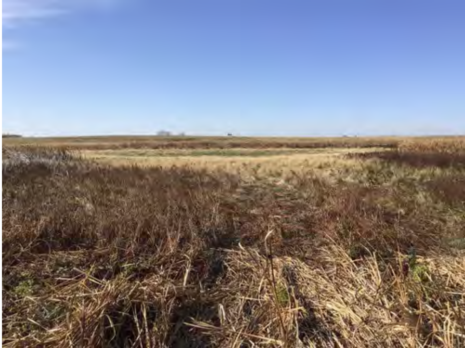
17. Wetland A-64, looking southwest October 1, 2021.