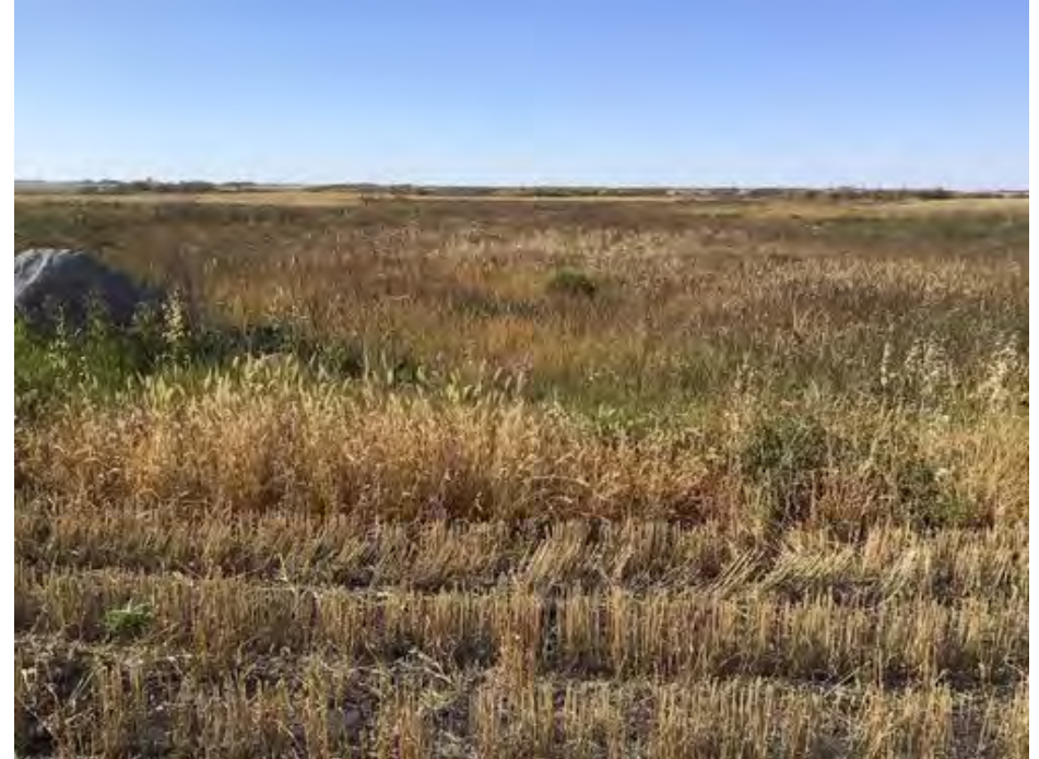
30. Wetland A-119, looking west October 1, 2021.