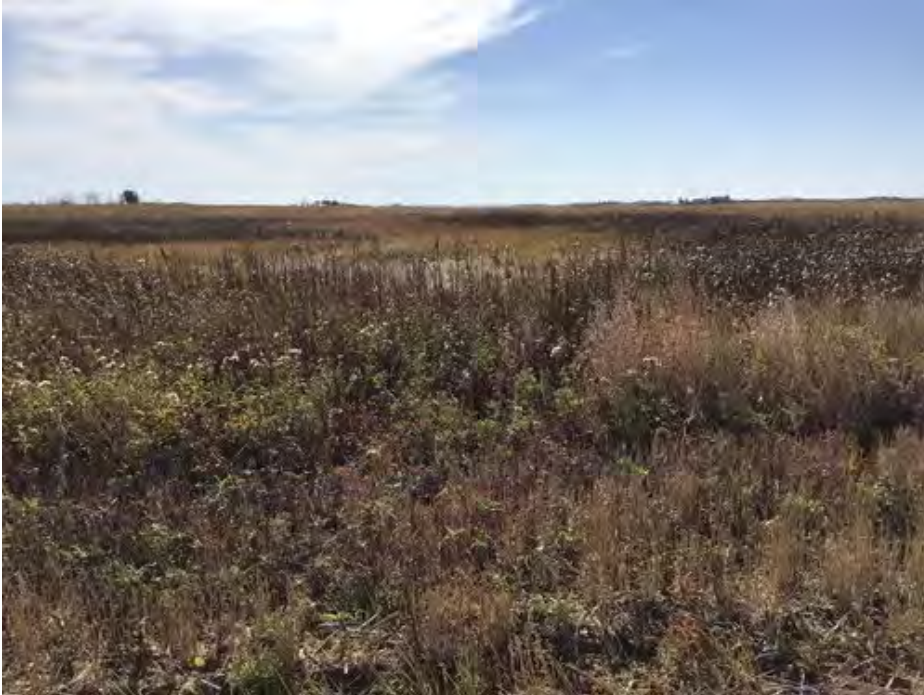
29. Wetland A-118, looking south October 1, 2021.