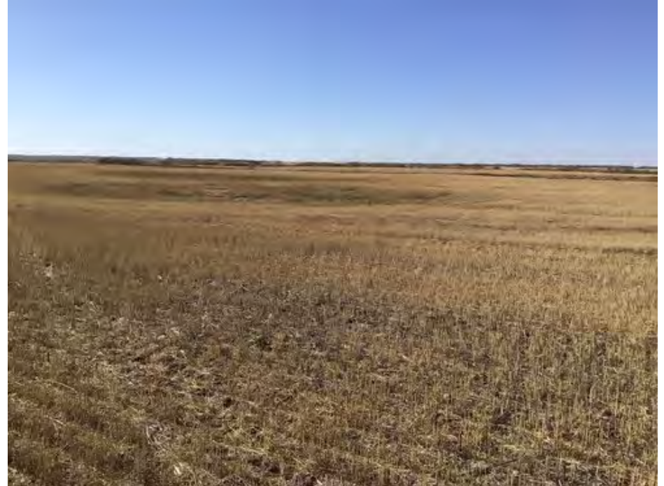
26. Wetland A-114, looking southwest from centerline October 1, 2021.