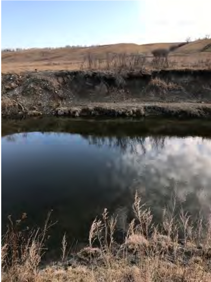
3. Pipestone Creek flowline crossing, looking north April 21, 2021.