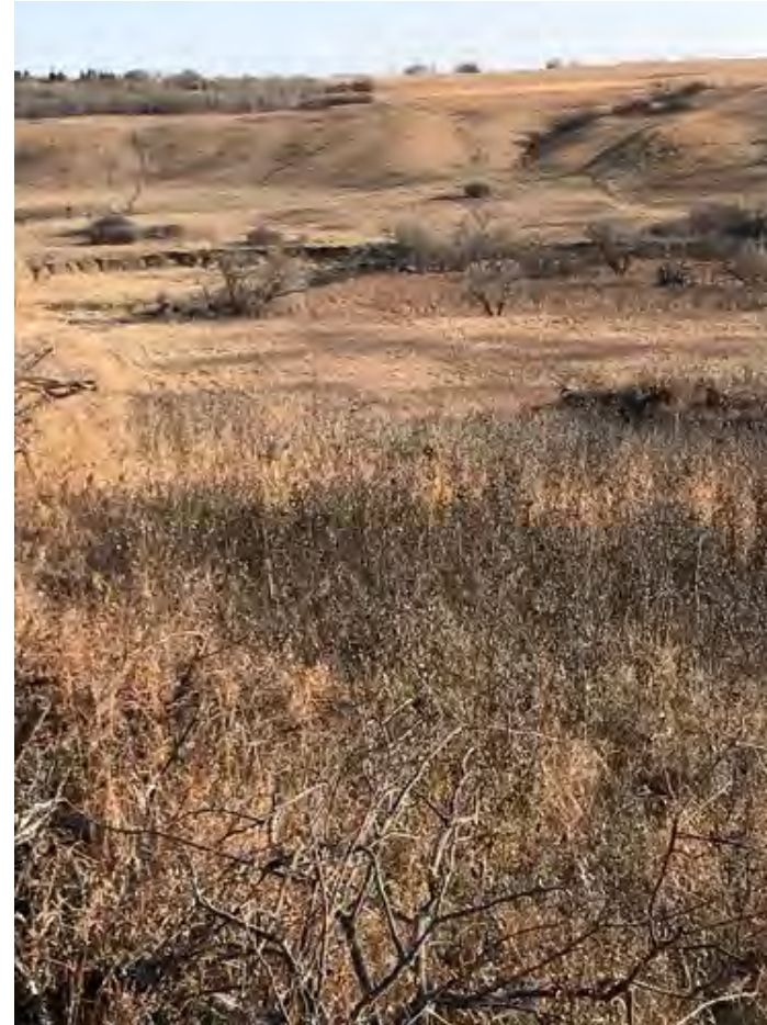
2. Looking north along flowline footprint, Pipestone Creek in the mid-ground April 21, 2021.