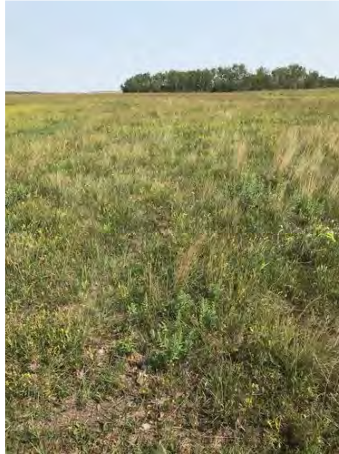
6. Modified grassland looking north June 9, 2021.