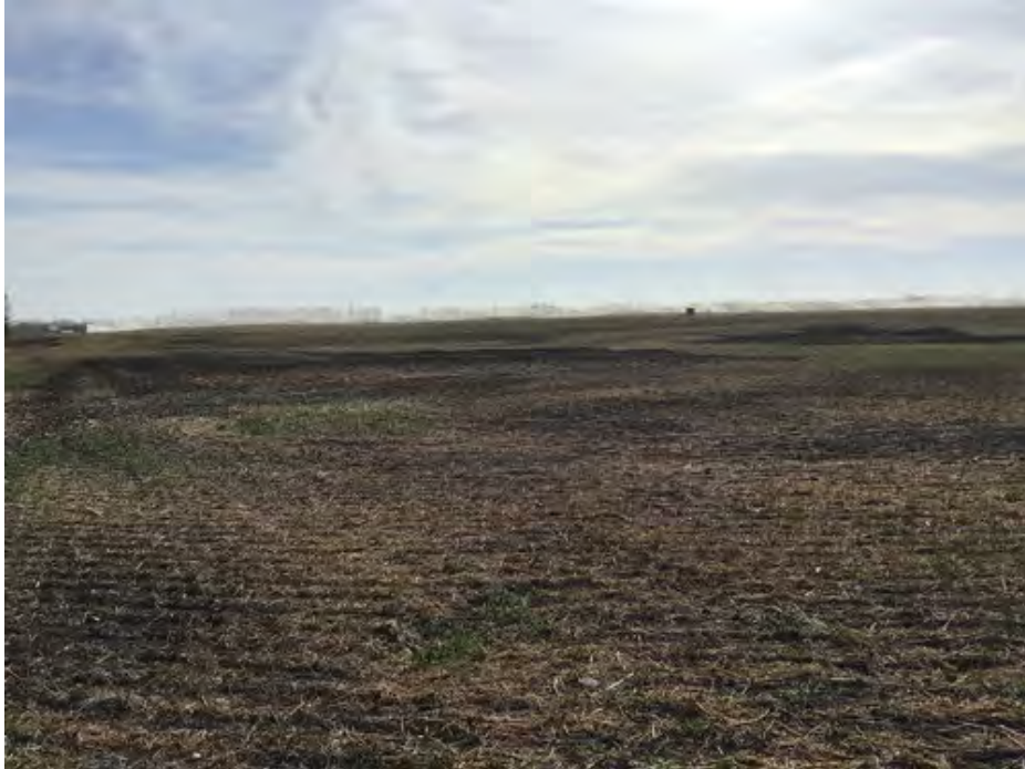
13. Wetland A-12, looking southeast October 1, 2021.