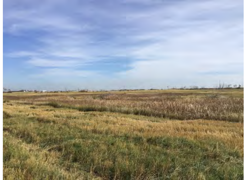
24. Wetland A-105, looking north October 1, 2021.