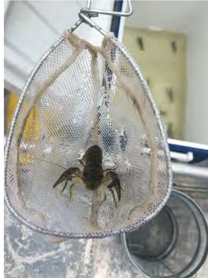
8. Northern crayfish captures during aquatics assessment on Pipestone Creek June 11, 2021.