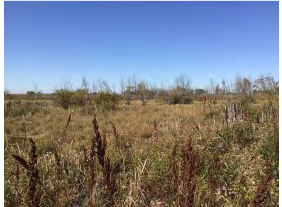
12. Wetland A-2 Looking west October 1, 2021.