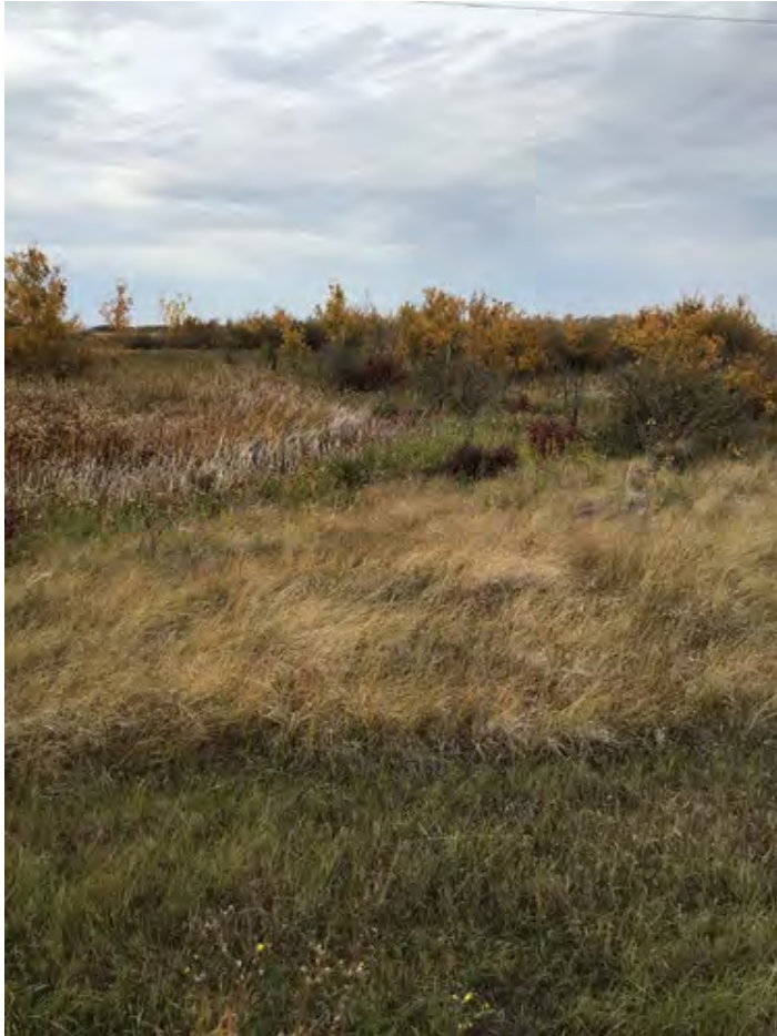
21. Wetland A-78, looking north October 1, 2021.