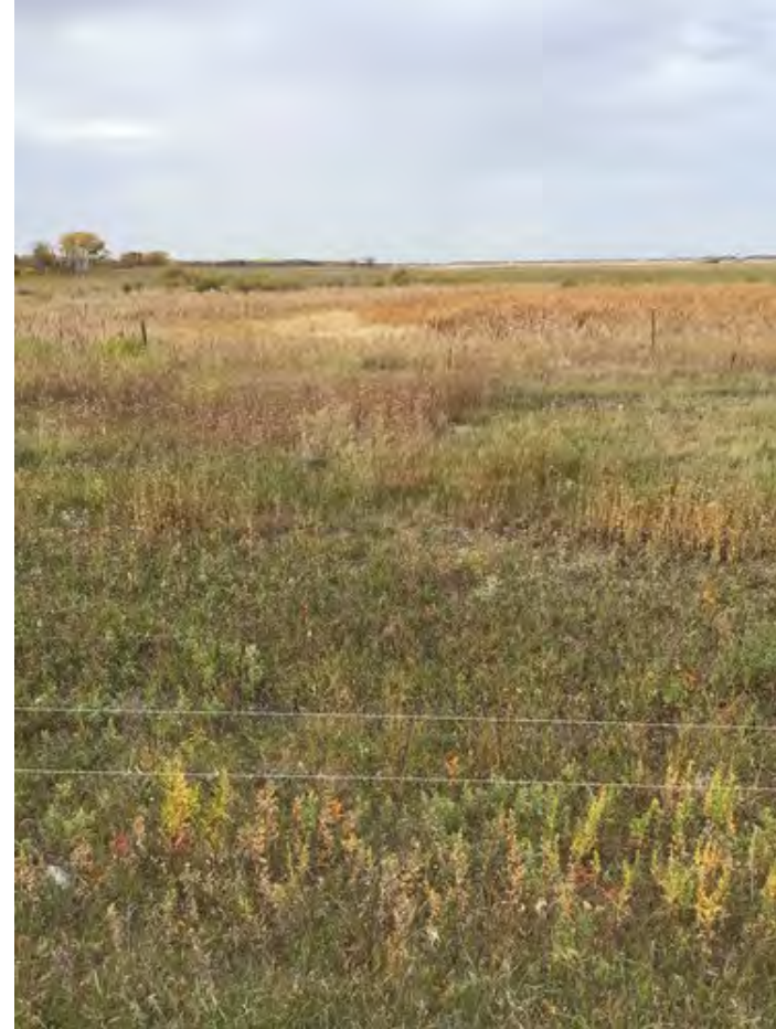
14. Wetland A-48, looking north October 1, 2021.