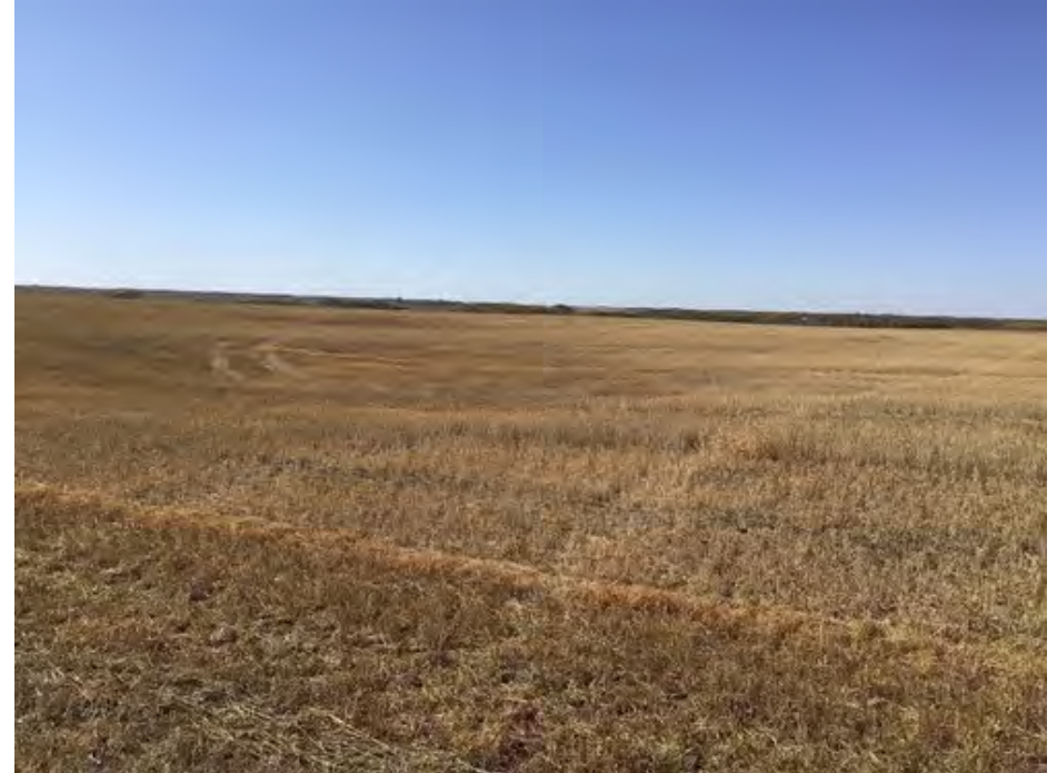
28. Wetland A-117, looking southwest from centerline October 1, 2021.