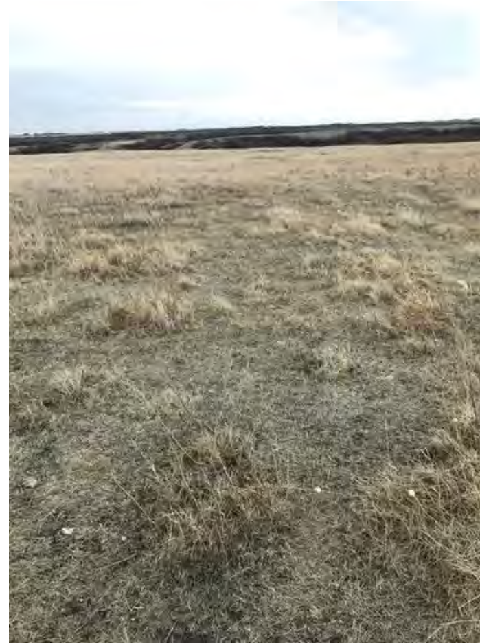
4. Sharp-tailed grouse dancing ground (lek) # 1, looking south toward Pipestone Creek April 21, 2021.