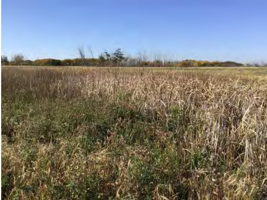
23. Wetland A-103, viewing west from flowline edge October 1, 2021.