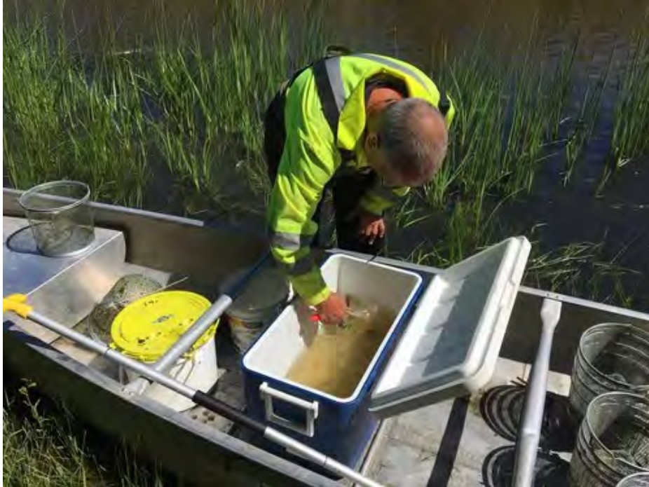
9. Sampling fish near shoreline on Pipestone Creek June 11, 2021.