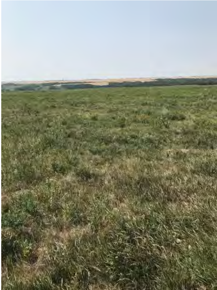
5. Modified grassland looking south toward Pipestone Creek valley July 31, 2021.