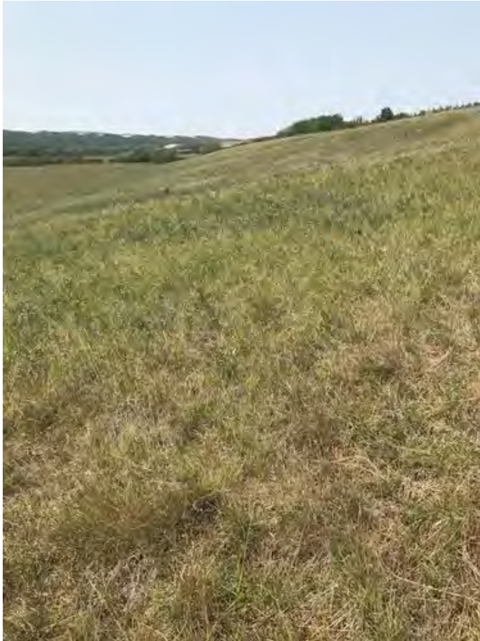
1. Native grassland on south facing slope along Pipestone Creek looking west July 30, 2021.