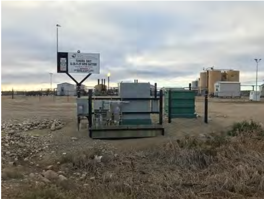
19. Looking west at Tundra Daly 08-28-009-29 W1M battery site.