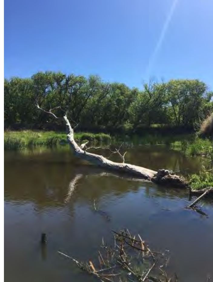
10. Pipestone Creek, east of Cromer June 11, 2021.