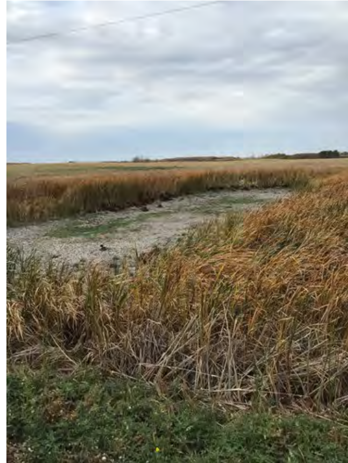
20. Wetland A-75, looking northwest October 1, 2021.