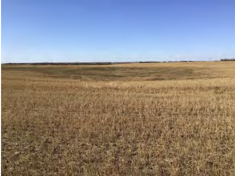
25. Wetland A-112, looking west from flowline edge October 1, 2021.