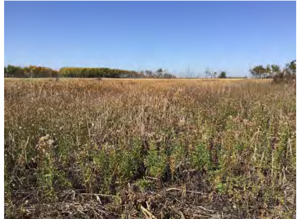
22. Wetland A-102, looking west from flowline edge October 1, 2021.