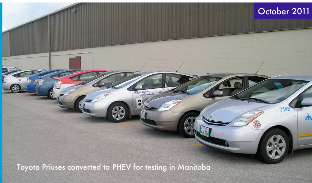
Toyota Priuses converted to PHEV for testing in Manitoba