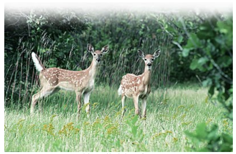
White-tailed deer fawns