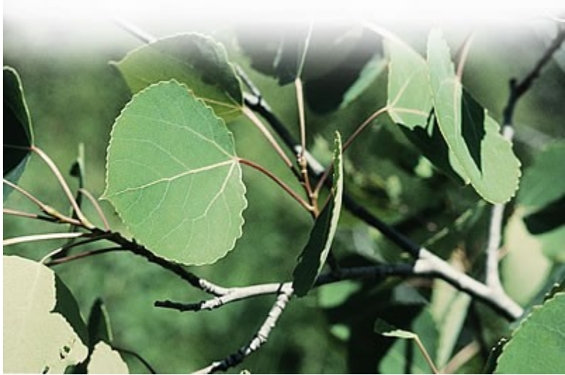
Trembling aspen, named after its leaf which trembles with the slightest breeze, is common in the park.

The concentration of so many, different plant communities in a relatively small area is one of Birds Hill's distinctive features. In the same park, on the same day you can stroll through tall grass (big bluestem), pick chokecherries at the edge of an aspen stand, feel the coolness in a cedar bog's shade and admire colourful wildflowers in a mixed-grass prairie.