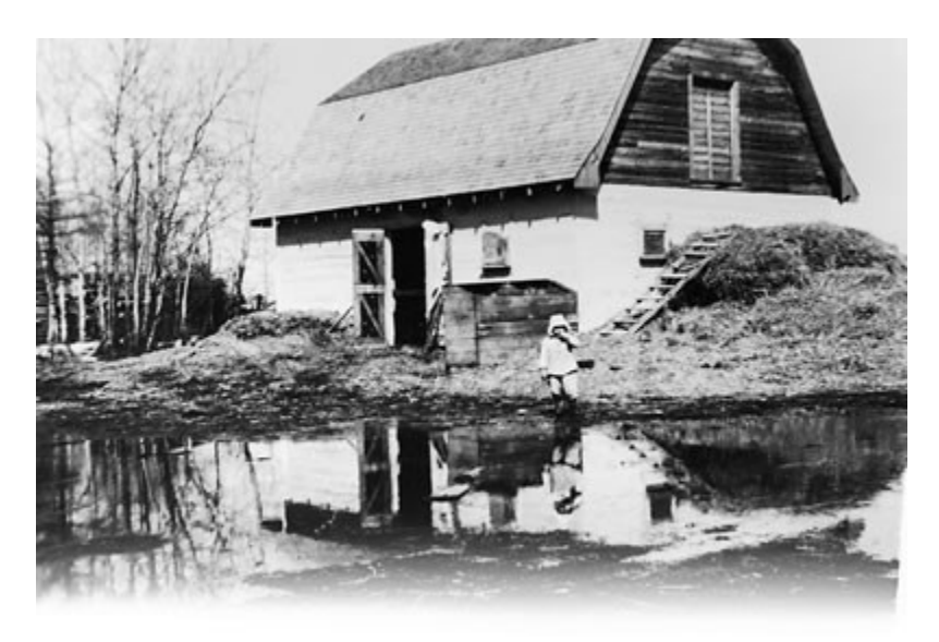
Kudlowich barn, c 1940

Today, the park continues to be a refuge as it was for Red River settlers more than 150 years ago. People escaping the hustle and bustle of modern living can find a peaceful retreat in Birds Hill Provincial Park