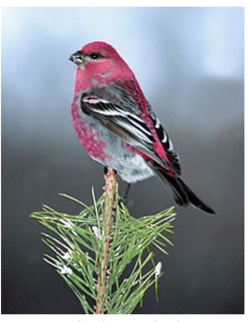
Male pine grosbeak.