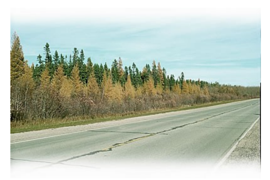
Tamarack/black spruce bog, Circle Tour Site # 6

Circle Tour # 7 Bur Oak Self-guiding Trail loops through a stand of gnarled bur oaks. Summer and winter interpretive signs along the trail describe the animals and plants that thrive in this area. A braille version of interpretive sign texts is available at the park office. Designed to accommodate all visitors, the path is asphalt covered, and the adjacent picnic tables and washrooms provide barrier-free access. The loop is 1 km (0.6 mi.); allow 45 minutes. A mountain bike trail system is also accessible from the Bur Oak parking lot.