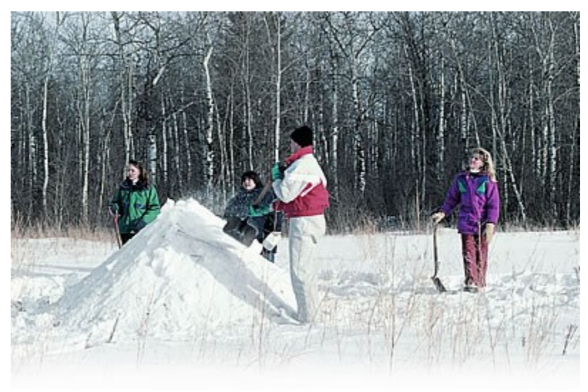
Quinzhee building, winter school program

During the summer months, pick up a program schedule at the campground office or check the program event posters on bulletin boards. Campfires, amphitheatre shows, children's programs and special events are presented weekly from mid-June to early September. Special events are also held during the winter months.