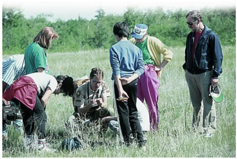
Interpretive programs are offered year-round.

During the summer months, pick up a program schedule at the campground office or check the program event posters on bulletin boards. Campfires, amphitheatre shows, children's programs and special events are presented weekly from mid-June to early September. Special events are also held during the winter months.