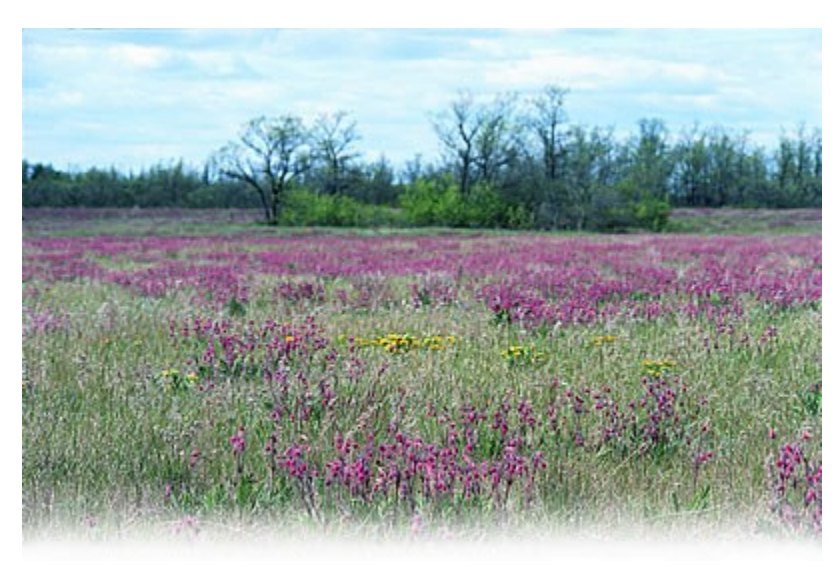
Aven prairie in bloom. Circle Tour site 3.

Given the trend for urban expansion and the desire of many people to live outside the city limits, this piece of public land has become, over the last few decades, a valuable natural environment that is within easy reach of most city dwellers.