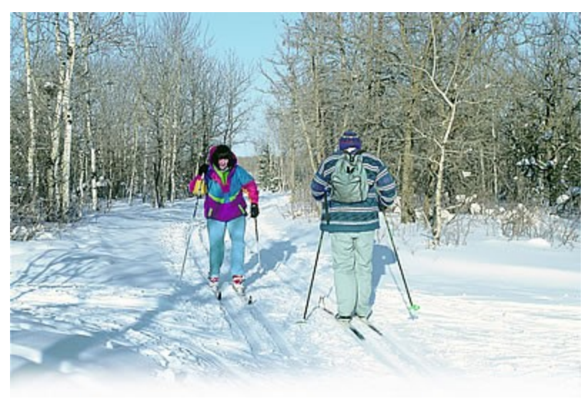
Cross-country ski trail

Explore Birds Hill on horseback. Several trails in the northern part of the park are accessible from the riding stable. Trail rides leave on the hour all summer long. Pony rides for young adventurers, hay rides for large groups, breakfast or steak rides and winter sleigh rides are also available. For further information, call the riding stable at 204-222-1137. Restaurant services are provided adjacent to the stable. The 16-km (10-mi.) Bridal Path can be used throughout the year for horseback riding and horse-drawn vehicle driving.