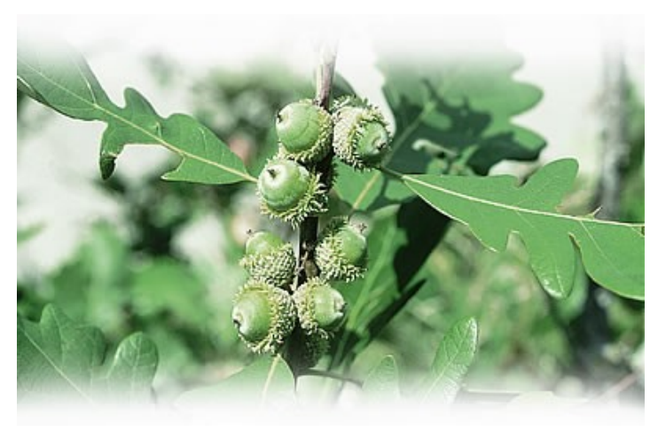
Bur oak acorns

The patches of prairie that remain are reminders of the large grasslands that once covered much of southern Manitoba and were converted to farmland during settlement. Parkland is a transition zone and its plant communities are a blend of those found on the prairie and in the boreal forest. Wetlands are found in low-lying areas. Some of them are prairie potholes while others are like the black spruce/tamarack bogs found in the Whiteshell. One anomaly, the cedar bog, is more common to the Great Lakes-St. Lawrence forest region of Ontario and Quebec.