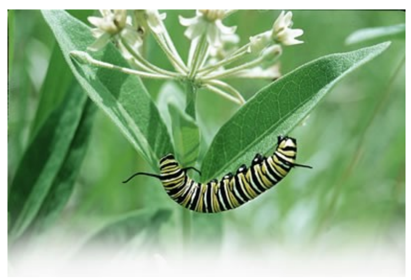
Monarch butterfly caterpillar (larva) on milkweed

Birds Hill Provincial Park is a birder's paradise. Since the park opened in 1967, over 200 species of birds have been sighted here. In early March, the arrival of migrants such as the horned lark is a sure sign that spring is just around the corner. During summer you will hear the clear whistle of the indigo bunting or the low, insect-like, buzzing call of the clay-coloured sparrow along many of the park trails. Fall is announced by the large number of birds that stop over on their southward journey. Small flocks of juncos and warblers are a common sight along park roadways.