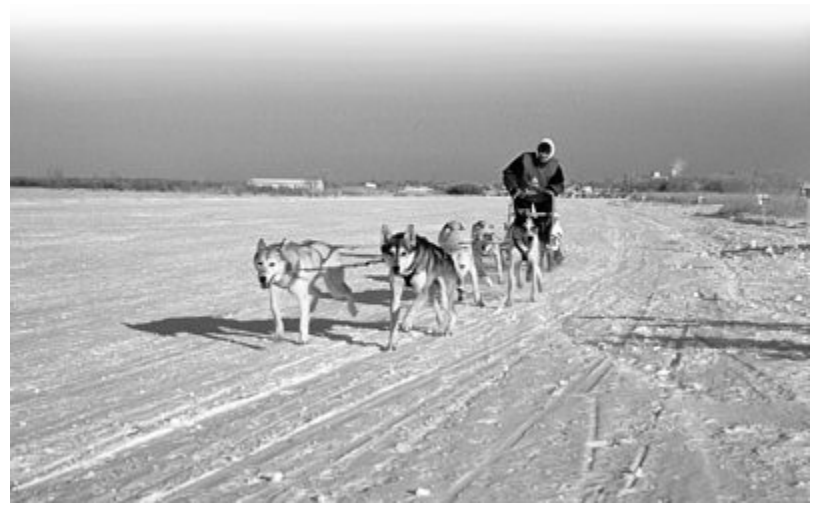
World championship dog-sled racing at The Pas Trapper's Fesitval

Manitoba's oldest, continuing winter festival started in the early 1900s when northerners came together from their winter camps to sell furs, buy supplies and socialize. Highlights include the World Championship dog-sled races and competitions (such as flour-packing, King and Queen Trapper) that test people's performance of traditional, northern-living skills. This week-long event is held in February.