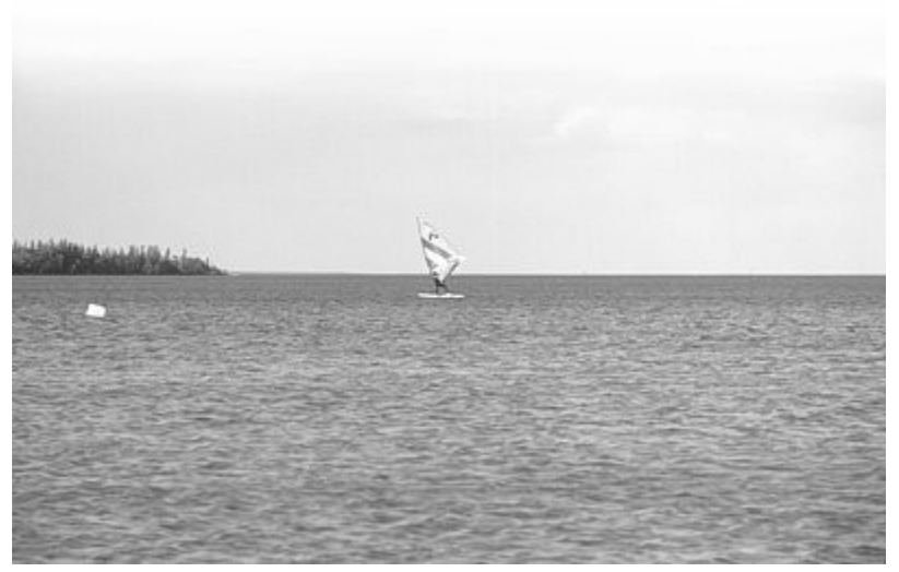
Windsurfing at Sunset Beach

forecasts and note any significant changes of wind direction. Be sure your boat is equipped with basic safety gear and advise someone of your travel plans.