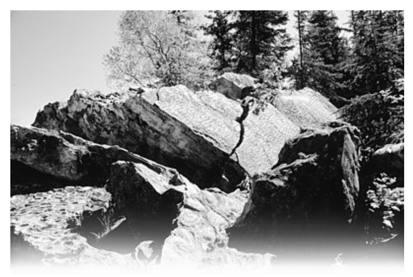
Rock formation on the Caves Self-guiding Trail