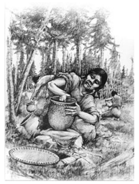
Making Clearwater Lake pottery

The forest environment was strange to the newcomers. Unlike the plains they had left behind, the forest contained different animals to hunt and plants to collect. Over time the new arrivals learned to hunt moose and woodland caribou with as much skill as they had to hunt bison. Fish also became an important source of food. Soon, dried moose meat or fish, mixed with fat and berries, replaced bison in making pemmican for winter storage. Still, trips were made to the plains to hunt bison, especially in the early years before the people had fully learned how to live in the forest.