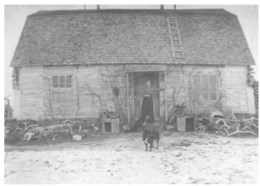
Alice Criddle in front of log house, 1898.