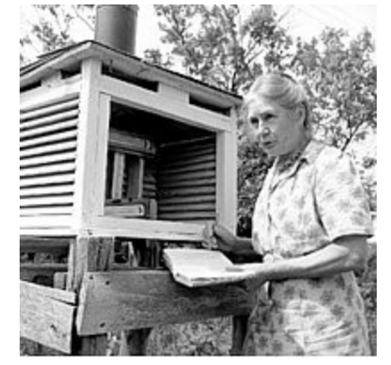
Maida at the weather station, 1953

The Thermometer Box as it was known contained a number of weather instruments. Percy brought thermometers from England but they broke the first winter-from the cold. A new set was sent from England that could endure a Manitoba winter. Percy began weather records in 1884 and sent one copy to Ottawa for the meteorological record. The second copy he kept and added notes about wildlife, bird migration, and other observations. It would become a valuable record of weather and natural history.