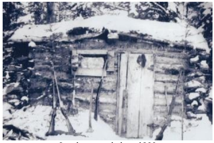
Log hunting shelter, 1900

Where you are standing was once one of the many gardens. Fruit and vegetables were nurtured and stored for the winter months. Each of the children had their own garden plot where they were encouraged to grow wild fruit. The children credited their knowledge of plants and insects to their work in the gardens. At an early age they were responsible for weeding and picking harmful insects from the plants. As adults several of the first generation bred their own plant varieties; Harry bred roses, Evelyn bred vegetables, Stuart bred lilies, Maida bred geraniums, Talbot bred lilacs and he crossed pumpkins with marrow to make marrowkins.