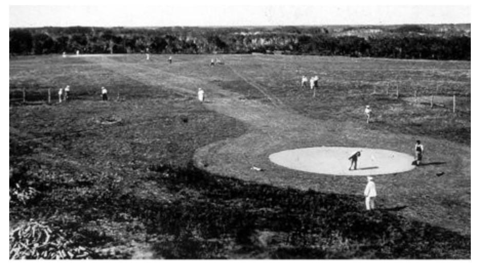
St. Albans Golf Course, 1915