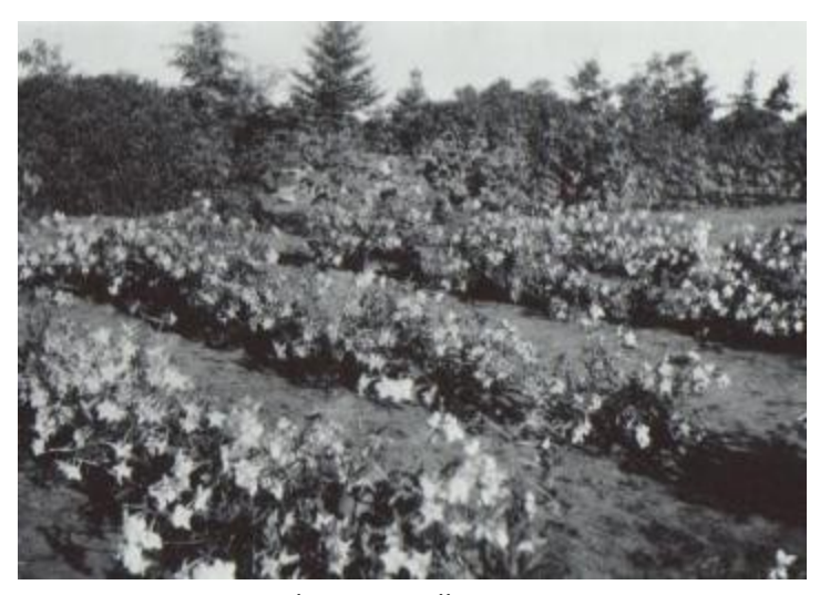
Garden at St. Albans, 1917

Where you are standing was once one of the many gardens. Fruit and vegetables were nurtured and stored for the winter months. Each of the children had their own garden plot where they were encouraged to grow wild fruit. The children credited their knowledge of plants and insects to their work in the gardens. At an early age they were responsible for weeding and picking harmful insects from the plants. As adults several of the first generation bred their own plant varieties; Harry bred roses, Evelyn bred vegetables, Stuart bred lilies, Maida bred geraniums, Talbot bred lilacs and he crossed pumpkins with marrow to make marrowkins.