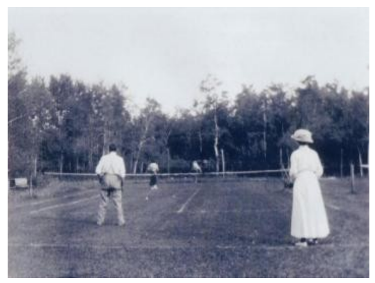
Playing tennis at St. Albans