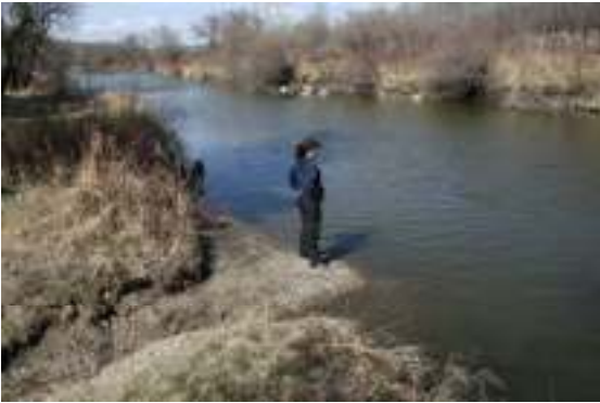
It's in our hands

There may also be resource/environmental issues that are not included here, but which affect or are important to you. Please let us know what these important issues are and how you would like to see them addressed. We are holding a number of public consultations in the watershed, it is important for you to come out and voice your opinion on which of these issues are most important and should be dealt with first.